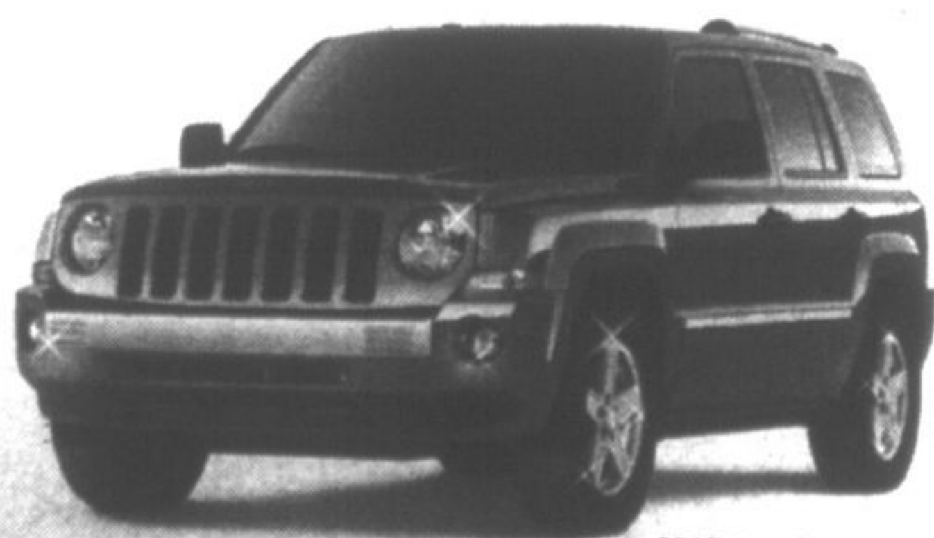
2010 Jeep Patriot Limited 4x4 shown.