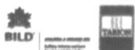
BILD 2009 Home Builder Of The Year.

A New Release Of Elegant 45' and 50' WideLot™ Homes Starting From $477,990