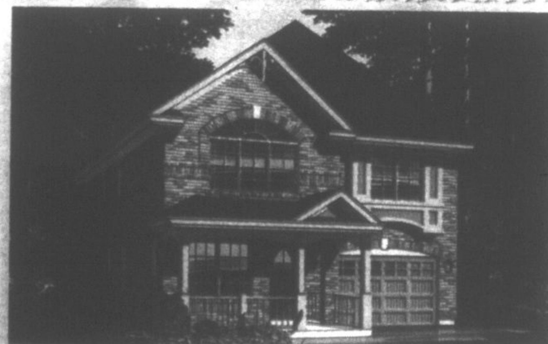
30' WideLot™, The Matheson 'B', 2,032 Sq.Ft.