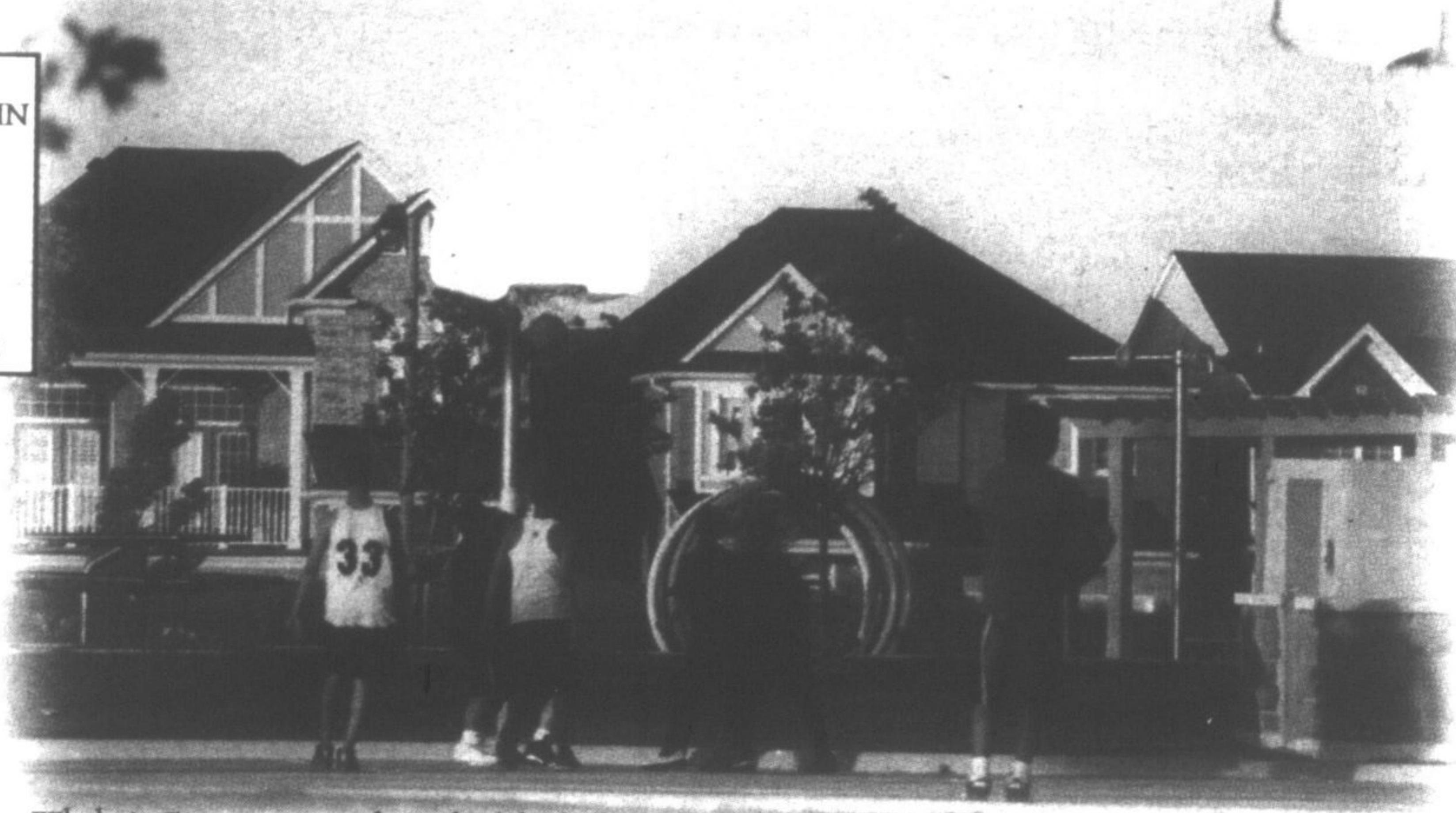
Wheler's Community Park And Basketball Court

Now, as well as our recently released elegant 45' and 50' WideLot™ homes in Stouffville, we are presenting our very final release of WideLot™ Townhomes, as well as 30', 36' and 40' detached homes in Wheler's on Main. Once these homes are gone, our Wheler's communities will be complete.