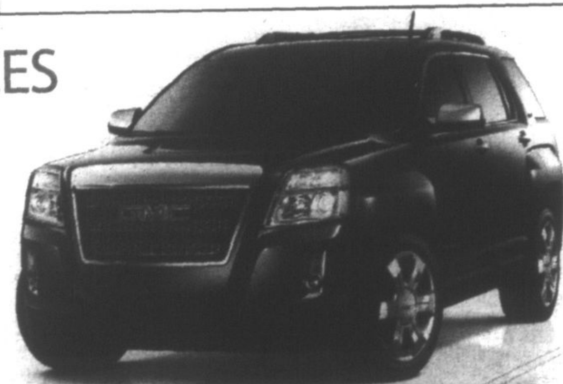
SLT-2 model shown