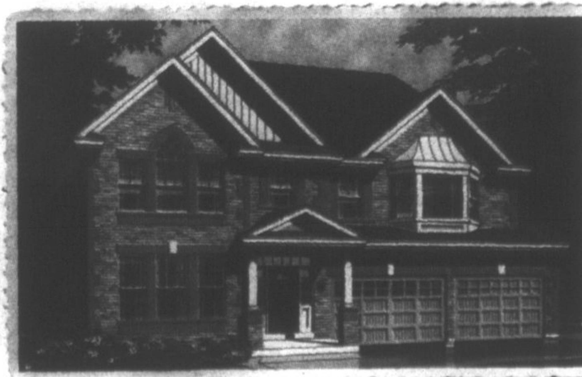
45' WideLot™, The Lakeview 'B', 3,122 Sq.Ft.