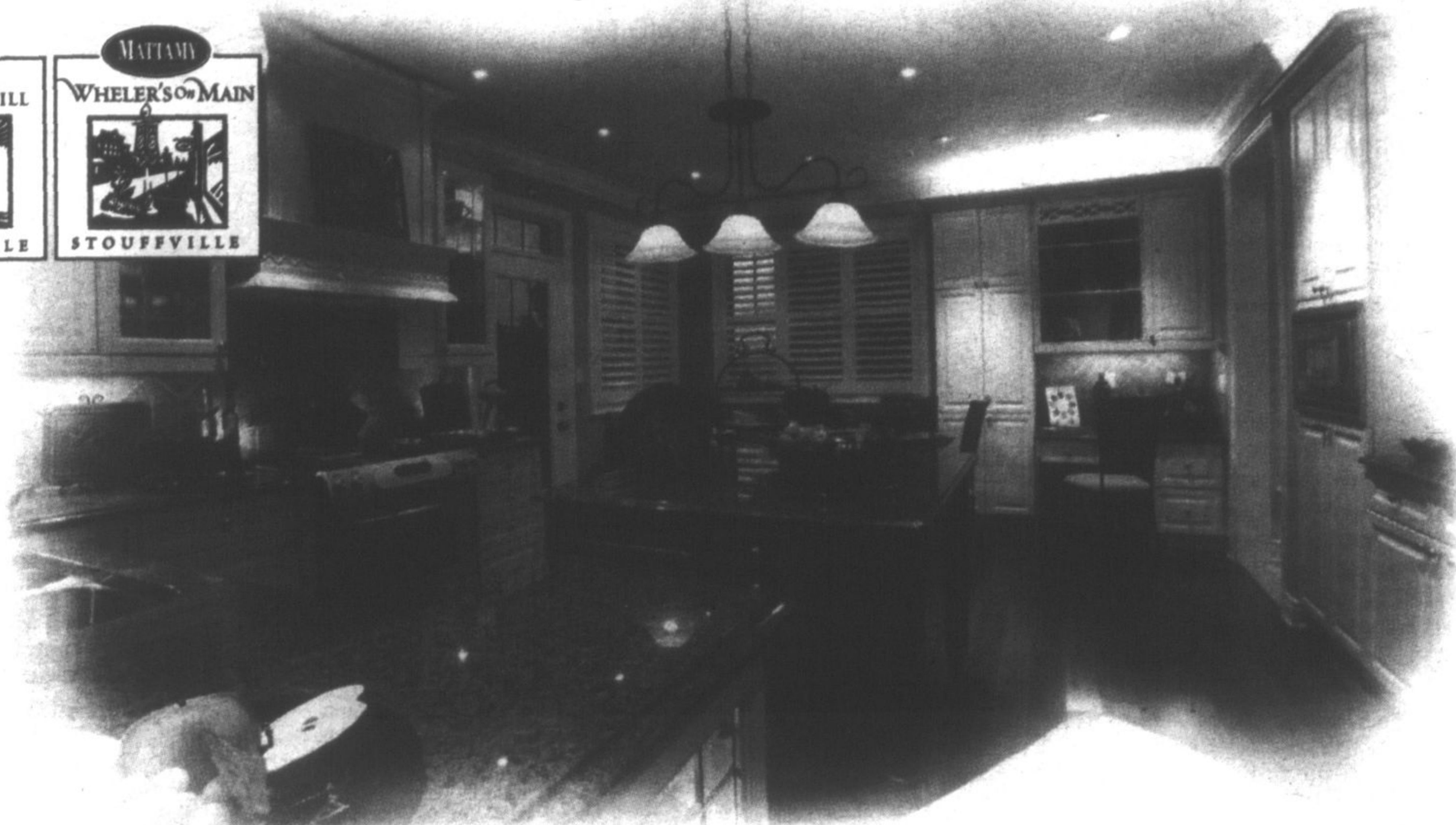
Wheeler's Mill 45' WideLot™ Kitchen

Our Wheeler's communities are well-regarded family neighbourhoods right in the heart of Stouffville. There is a pleasant family ambience, many homes that include front porches and special neighbourhood features such as lots of park space, gently winding streets, walking/biking trails and a great variety of homes so each street has a unique identity. There's even a new high school and elementary school built into the community. Shopping is conveniently located just minutes away in both Stouffville and Markham.