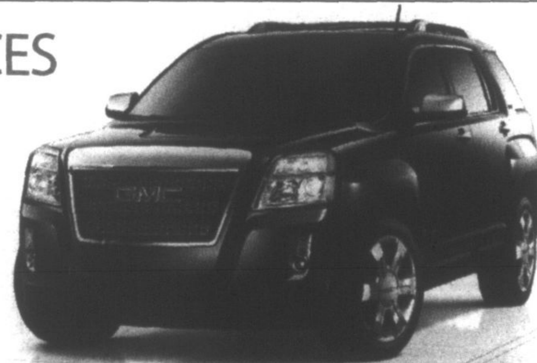
SLT-2 model shown