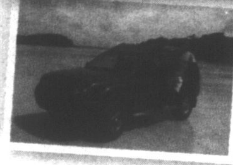
Ed's executive position transferred him to an exciting Caribbean adventure for a year.

No matter whether you have 6 or 60 months remaining on your lease, WE CAN GET YOU OUT OF YOUR LEASE quickly and easily.