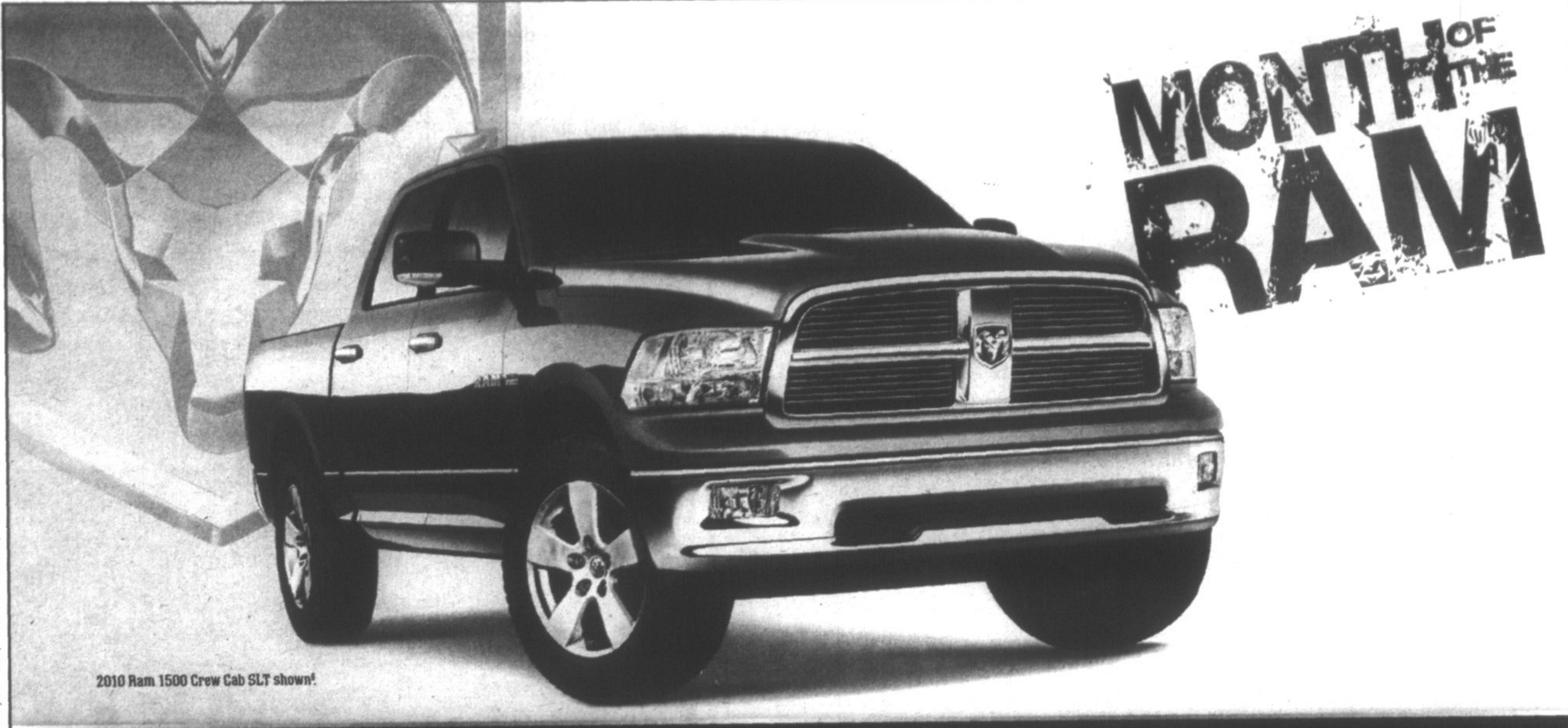
2010 Ram 1500 Crew Cab SLT shown†