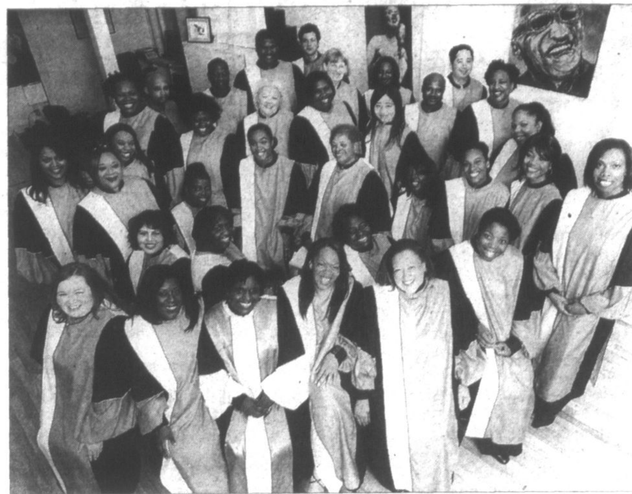
The Toronto Mass Choir performs at Springvale Baptist Church tomorrow night. The concert is a fundraiser for the Stouffville Christian School.

The show starts at 7 p.m. at Springvale Baptist, 3885 Stouffville Rd. Dessert will be served.