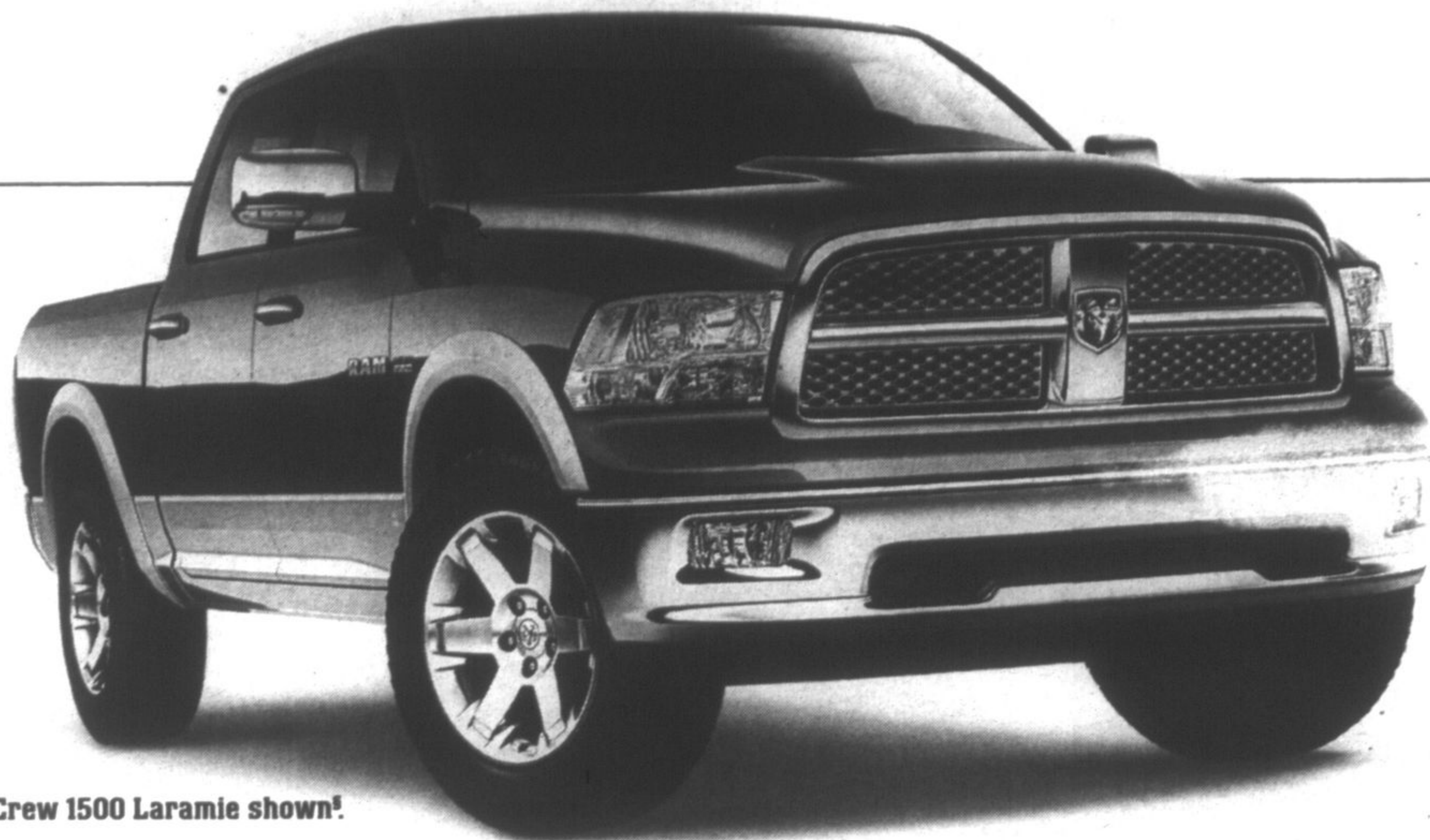
2010 Ram Crew 1500 Laramie shown † .