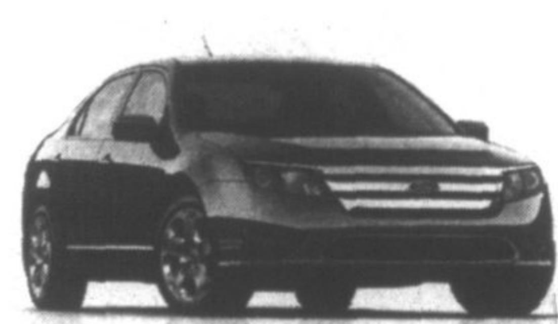
2010 FORD FUSION

Starting from $27,999* Includes $3,000 Delivery Allowance PLUS $1,000* Custom Cash Purchase Finance Edge I4 Automatic For $179 @ 2.99% APR Twice a month for 72 months with $2,600 down payment Offers exclude variable dealer admin charges, fuel fill charge and applicable taxes.