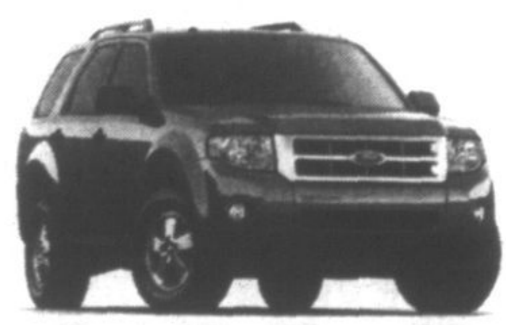
2010 FORD ESCAPE

Starting from $20,999* Includes $4,000 Delivery Allowance PLUS $1,000* Custom Cash Purchase Finance Escape I4 Automatic For $179 @ 2.99% APR Twice a month for 72 months with $2,600 down payment Offers exclude variable dealer admin charges, fuel fill charge and applicable taxes.