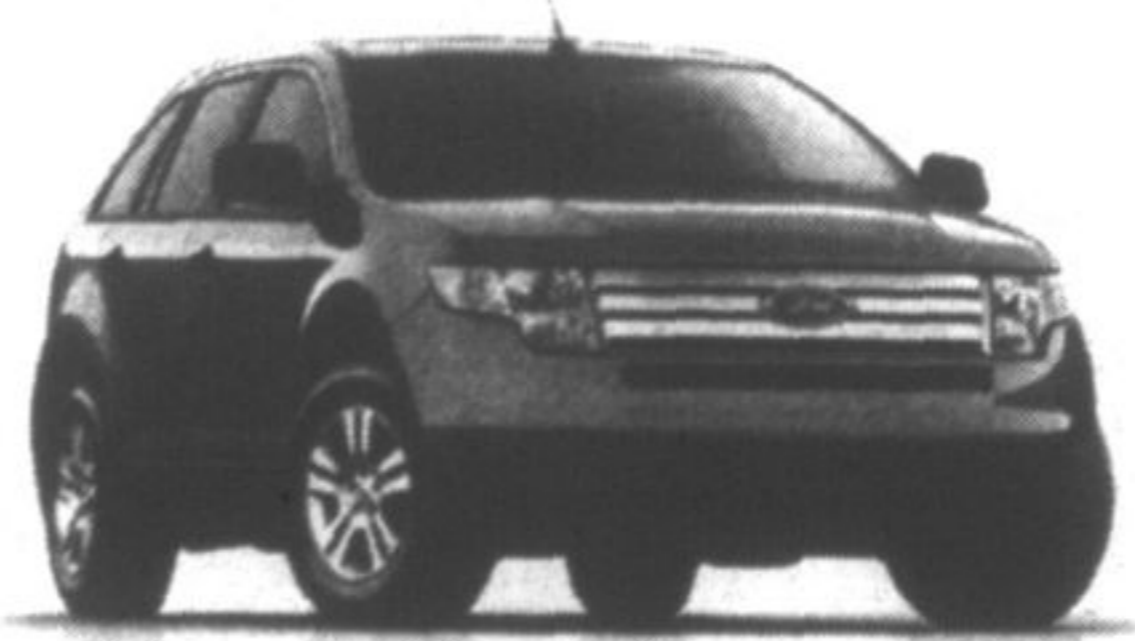
2010 FORD EDGE

Starting from $20,999* Includes $4,000 Delivery Allowance PLUS $1,000* Custom Cash Purchase Finance Escape I4 Automatic For $179 @ 2.99% APR Twice a month for 72 months with $2,600 down payment Offers exclude variable dealer admin charges, fuel fill charge and applicable taxes.