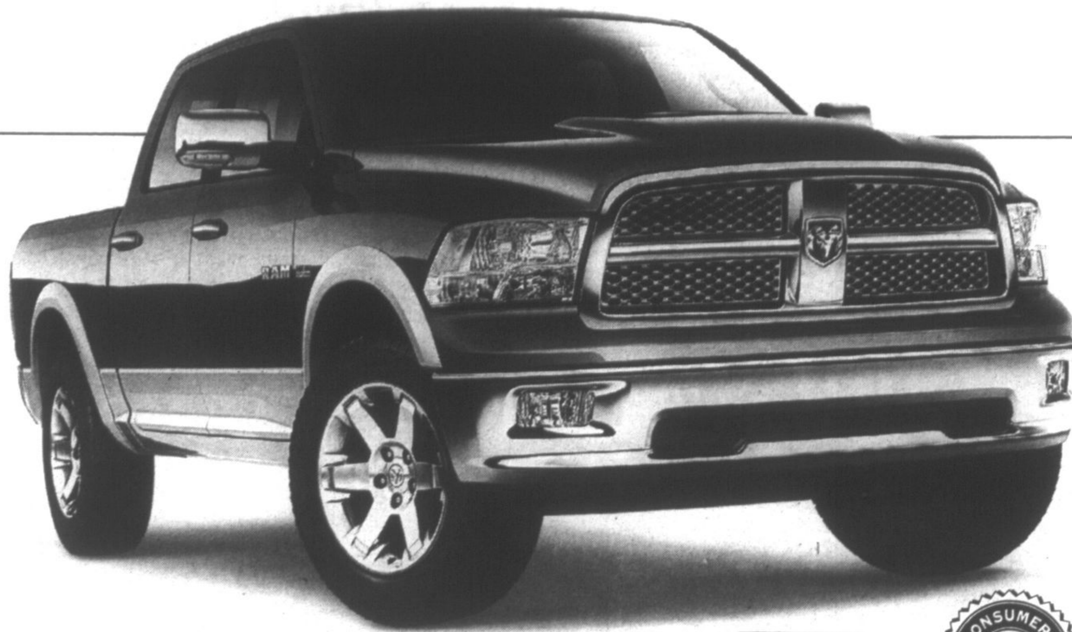
2010 Ram Crew 1500 Laramie shown!