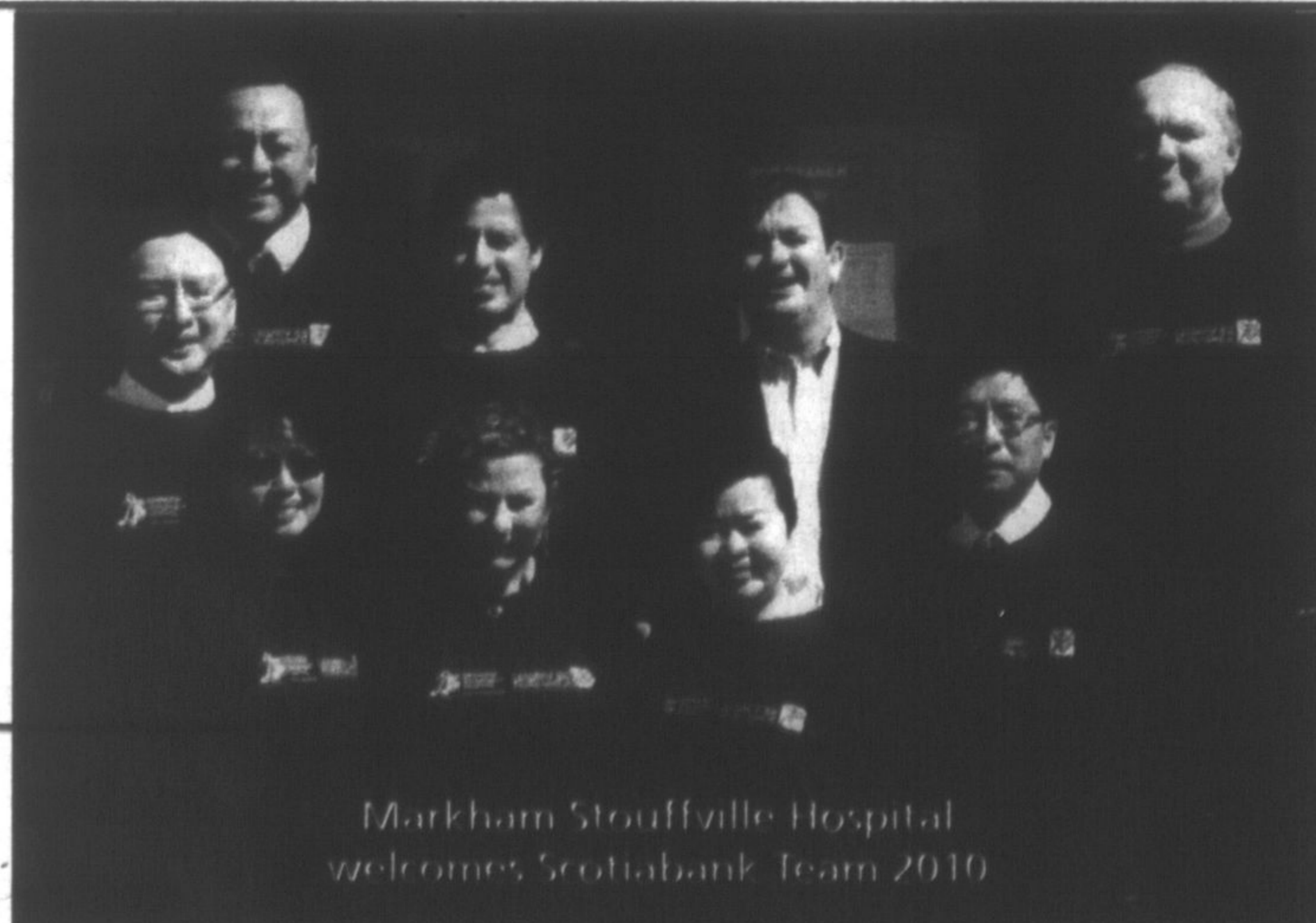
Markham Stouffville Hospital welcomes Scotiabank Team 2010

Register and Pledge online www.legacy5k.ca