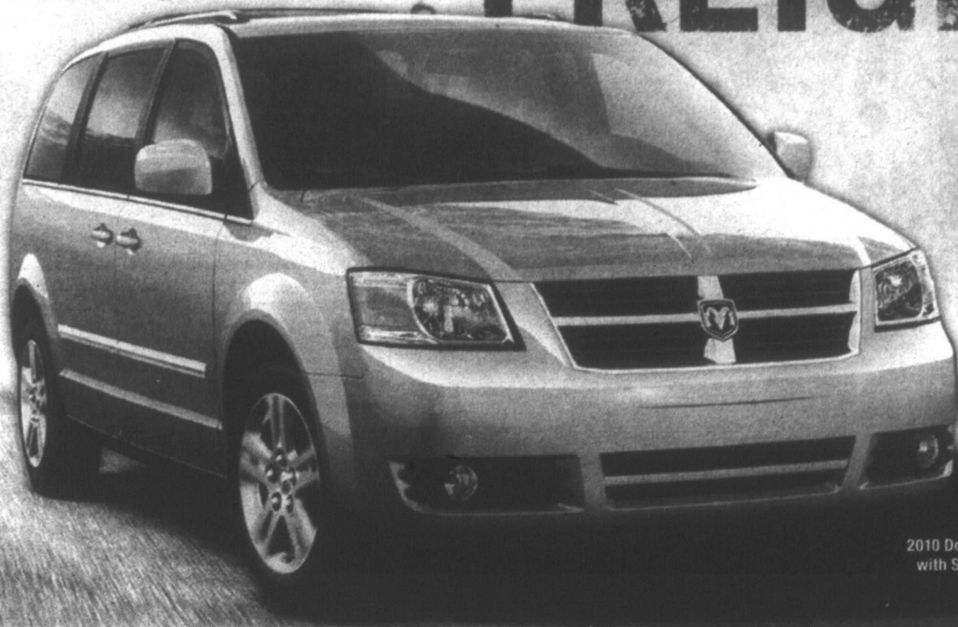
2010 Dodge Grand Caravan SXT with SXT Plus Group shown.**

WHEN YOU PICK UP YOUR NEW ELIGIBLE DODGE GRAND CARAVAN, YOU PICK UP AN EXTRA $1,400.*