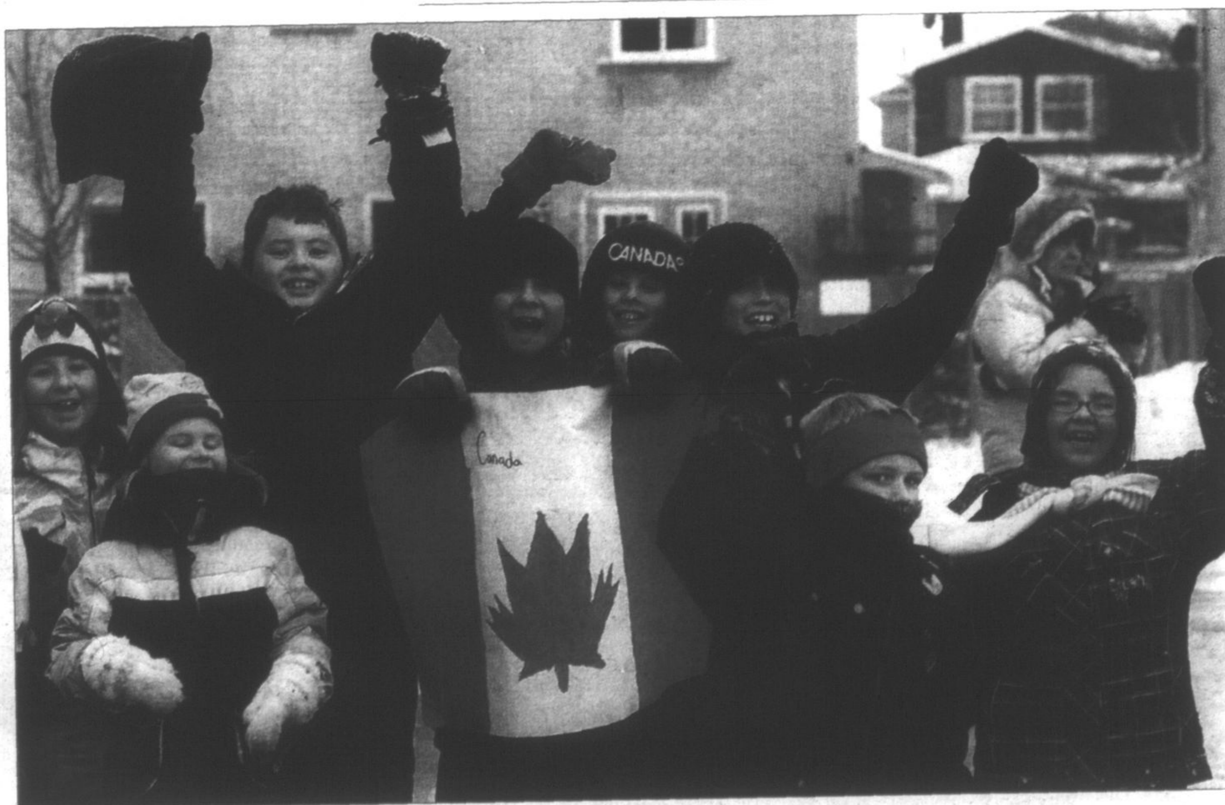
Students get into Olympic-like spirit during the week-long competition at the Millard Street school.