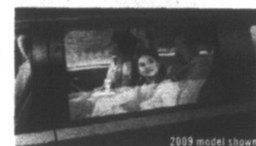
2009 model shown Available 2nd row power windows