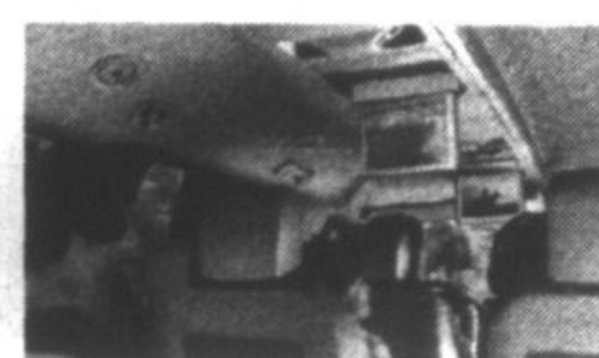
Dual DVD system available on SXT models