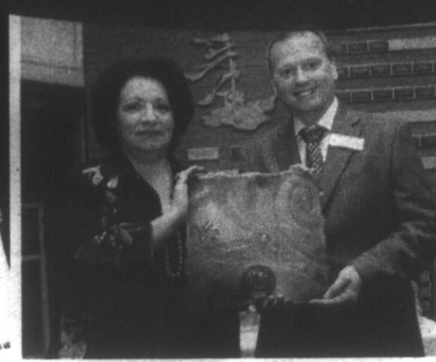
Installing the Theatre sign, 1984.