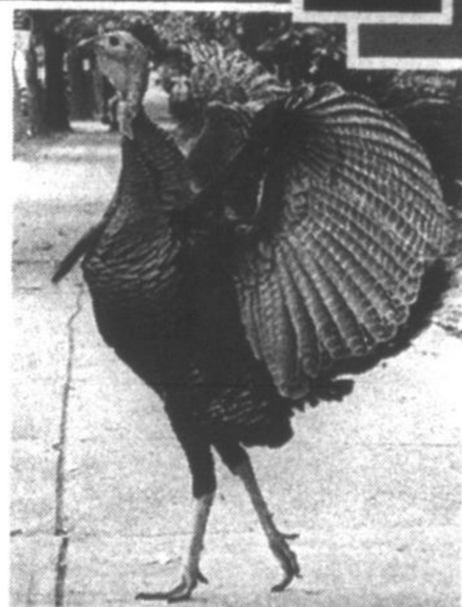
Sale ends Sat. Oct. 10th/09

10% off all supplements with a Nutritional Consultation