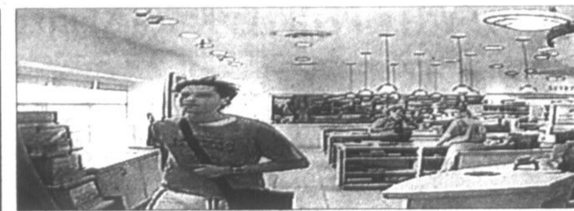
A suspect in liquor thefts walks out of Stouffville's LCBO.