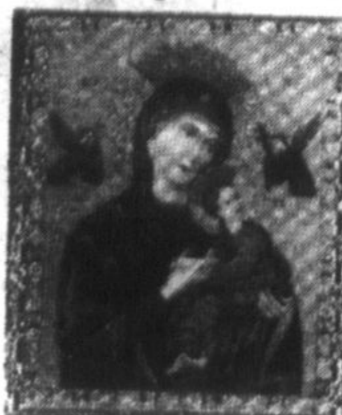
Our Mother of Perpetual Help

Holy Spirit Thou make me see everything and show me the way to reach my ideal. You who give the divine gift to forgive and forget the wrong that is done to me and who are in all instances of my life with me. I, in this short dialogue, want to thank You for everything and confirm once more that I never want to be separated from You no matter how great the material desire may be. I want to be with You and my loved ones in Your perpetual glory. Amen. Person must pray this 3 consecutive days without stating one's wish. After the 3rd day your wish will be granted no matter how difficult it may be. Promise to publish this as soon as your favor has been granted. M.S. & M.H.