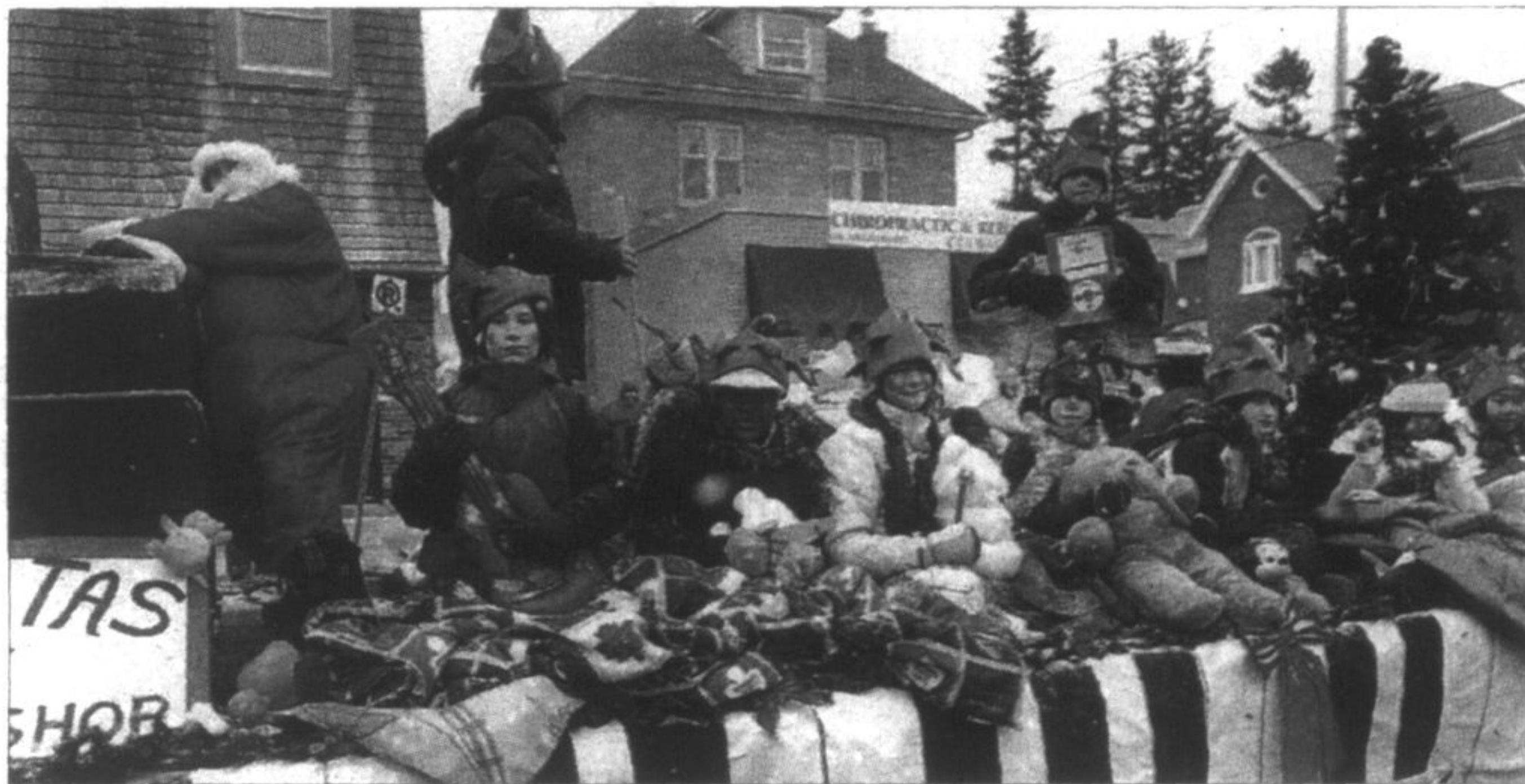
The new Oscar Peterson Public School won the top school award.