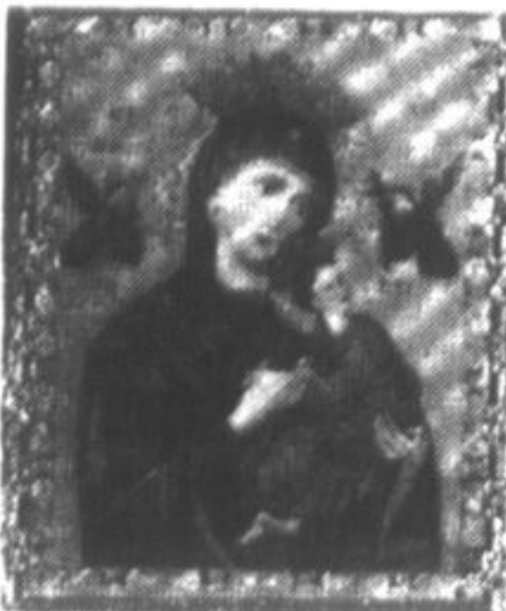
Our Mother of Perpetual Help