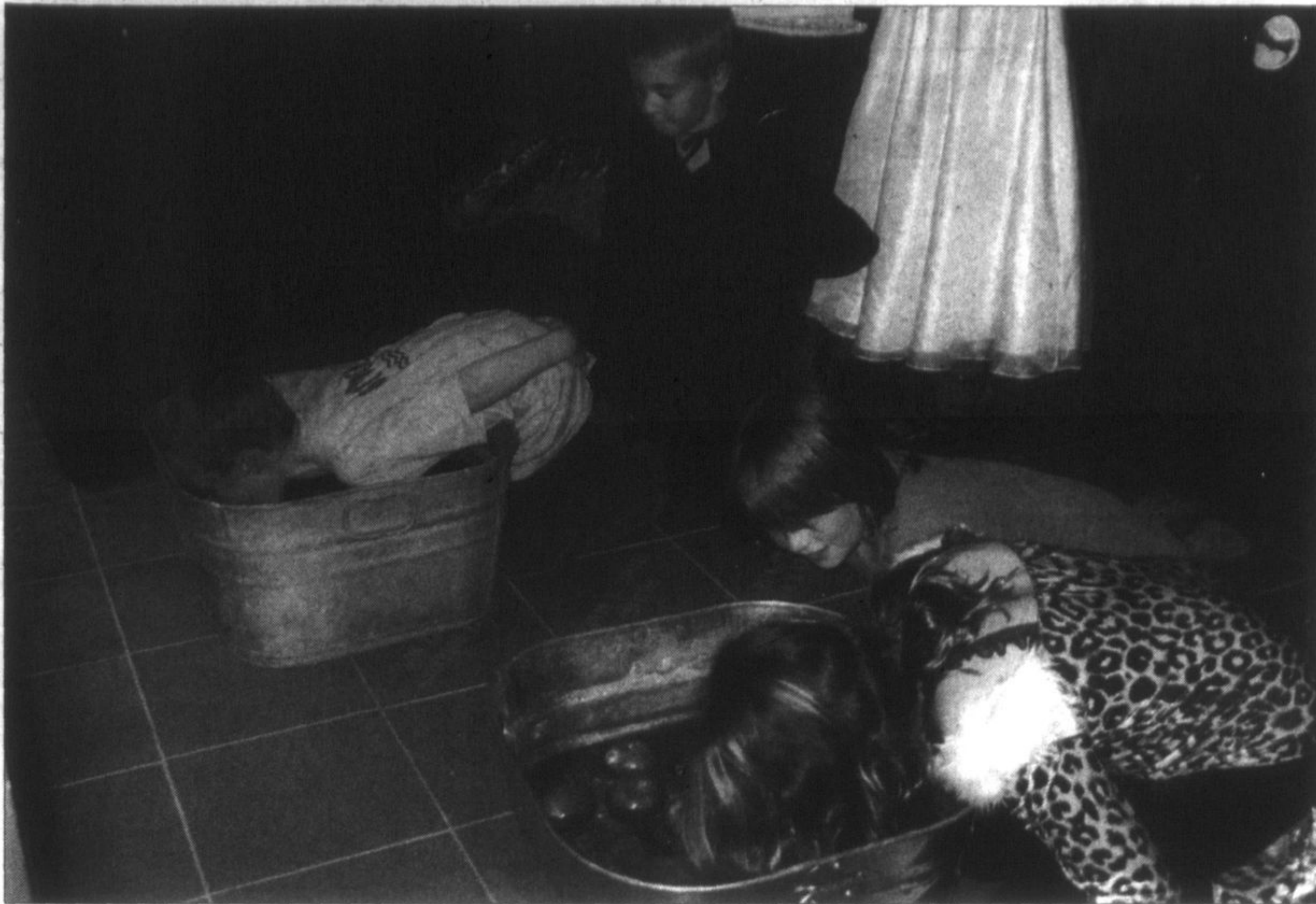
Children bob for apples during a Halloween party at the Whitchurch-Stouffville Public Library Friday night.