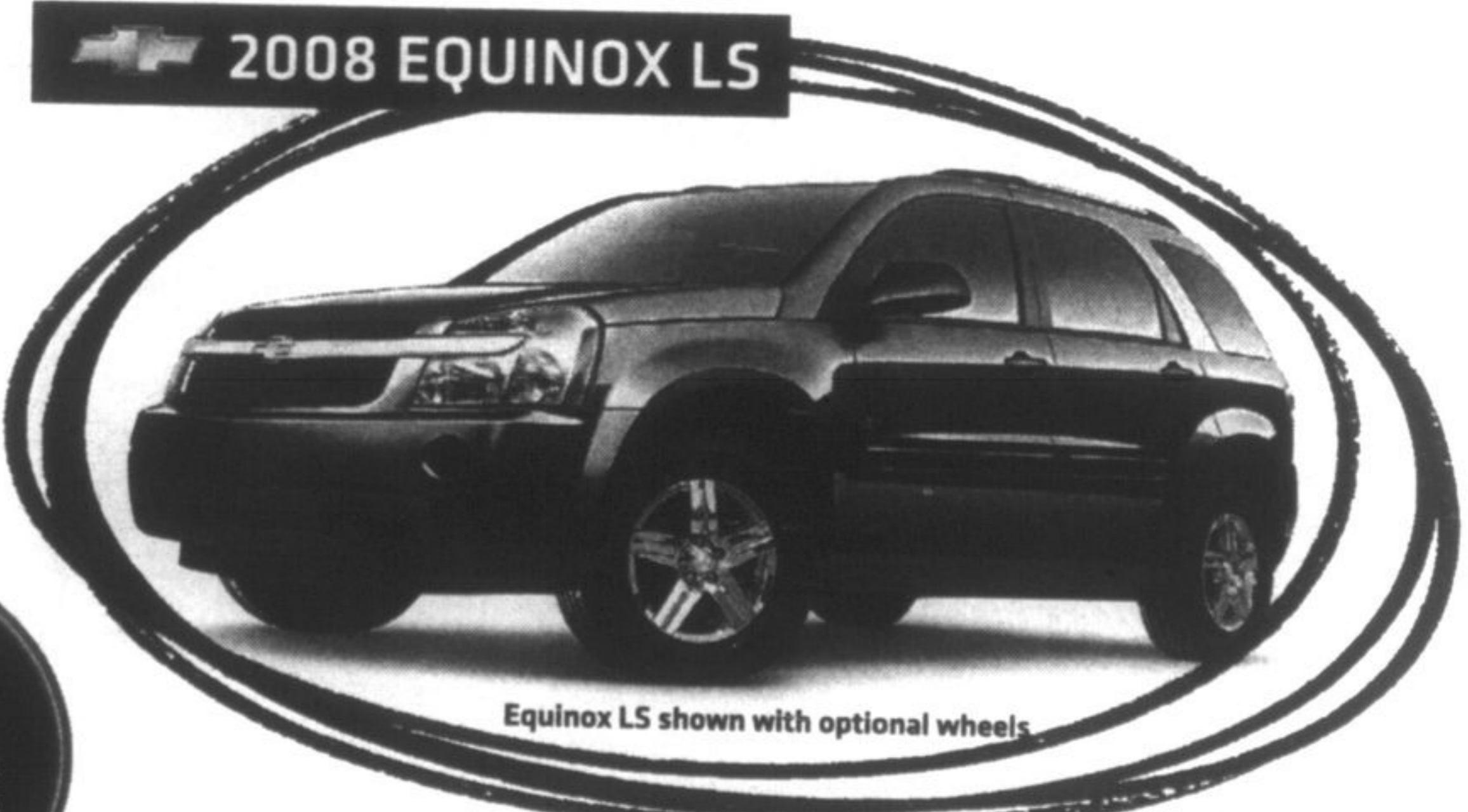
2008 EQUINOX LS