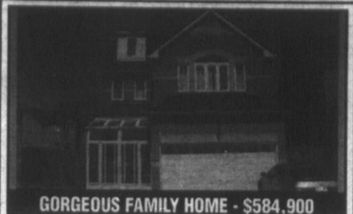
GORGEOUS FAMILY HOME - $584,900

This large executive home has 5 bedrooms, 3 of which have their own ensuite bath. There are hardwood and ceramic floors throughout the main level. The basement has been professionally finished with a large recreation room and a 3 piece bath. The premium lot is pie shaped and is fenced. Please call Phil for more details now.