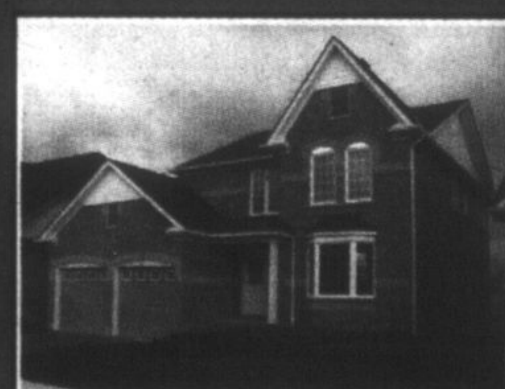
BEAVERBROOK INVENTORY HOME. SAVE LARGE. LAST ONE.