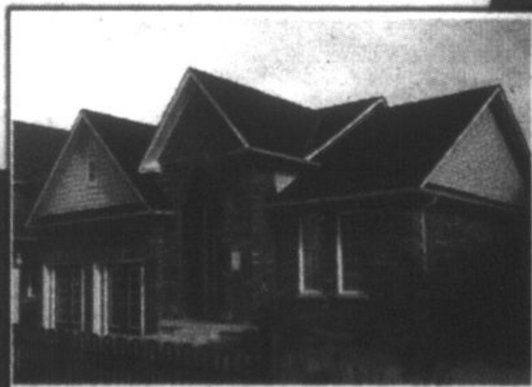
AMAZING BEAVERBROOK BUNGALOW MODEL IN MT. ALBERT.