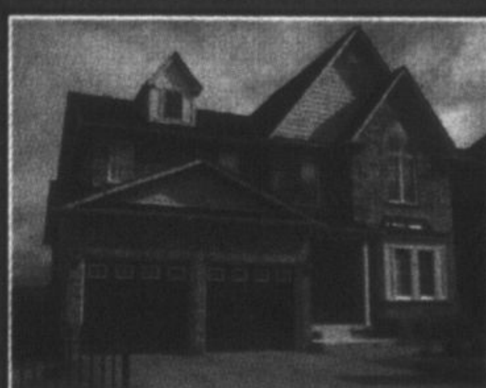
ABSOLUTELY GORGEOUS MODEL HOME IN MT. ALBERT, WITH WALK-OUT!