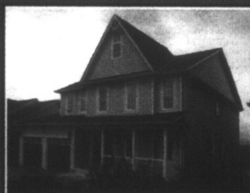
BEAVERBROOK MODEL WITH $100,000 IN UPGRADES!