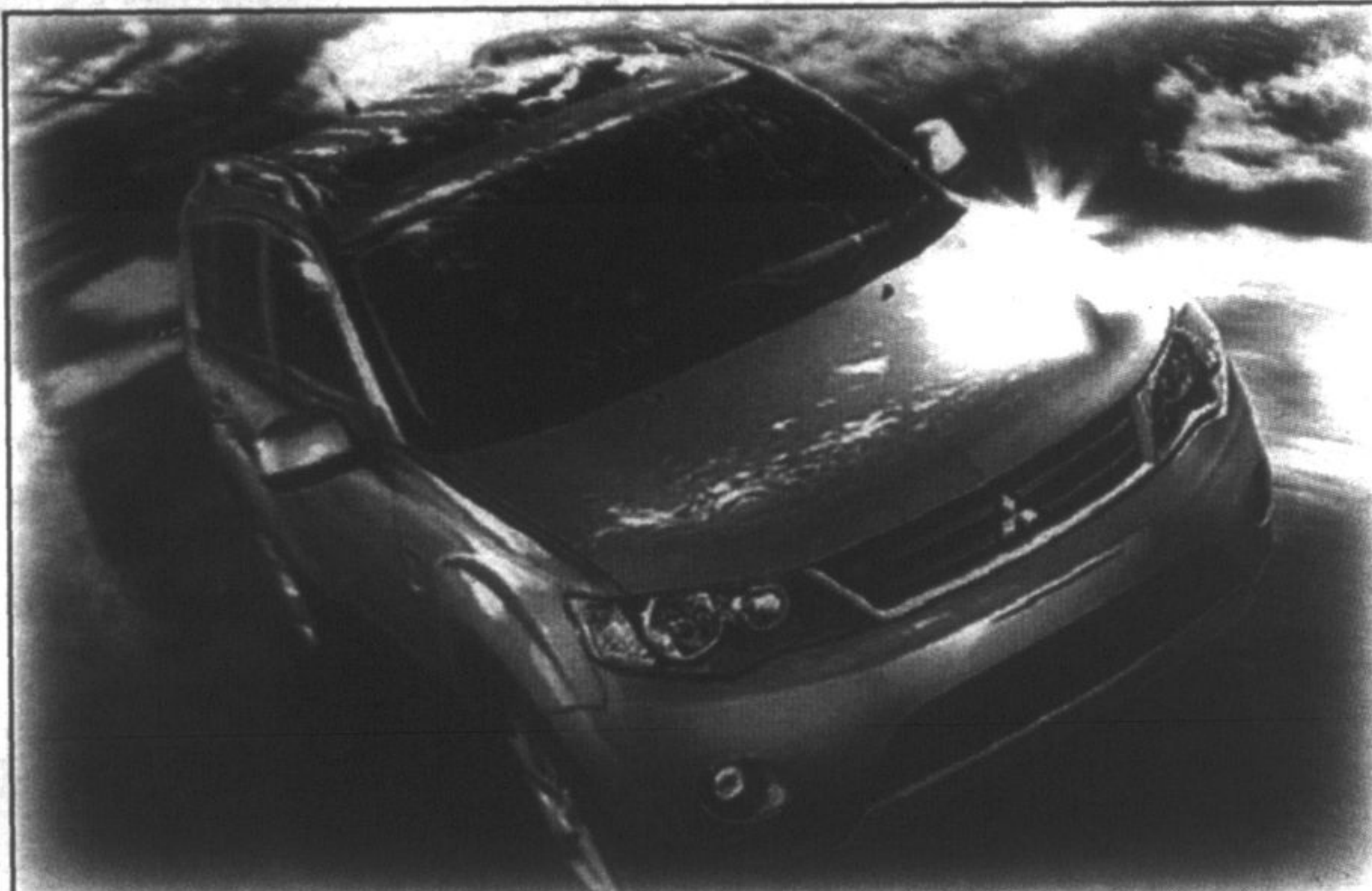
2008 OUTLANDER XLS

MARKHAM MITSUBISHI WILL DONATE $100 FROM EVERY VEHICLE SOLD DURING THE RIGHT TO PLAY EVENT.