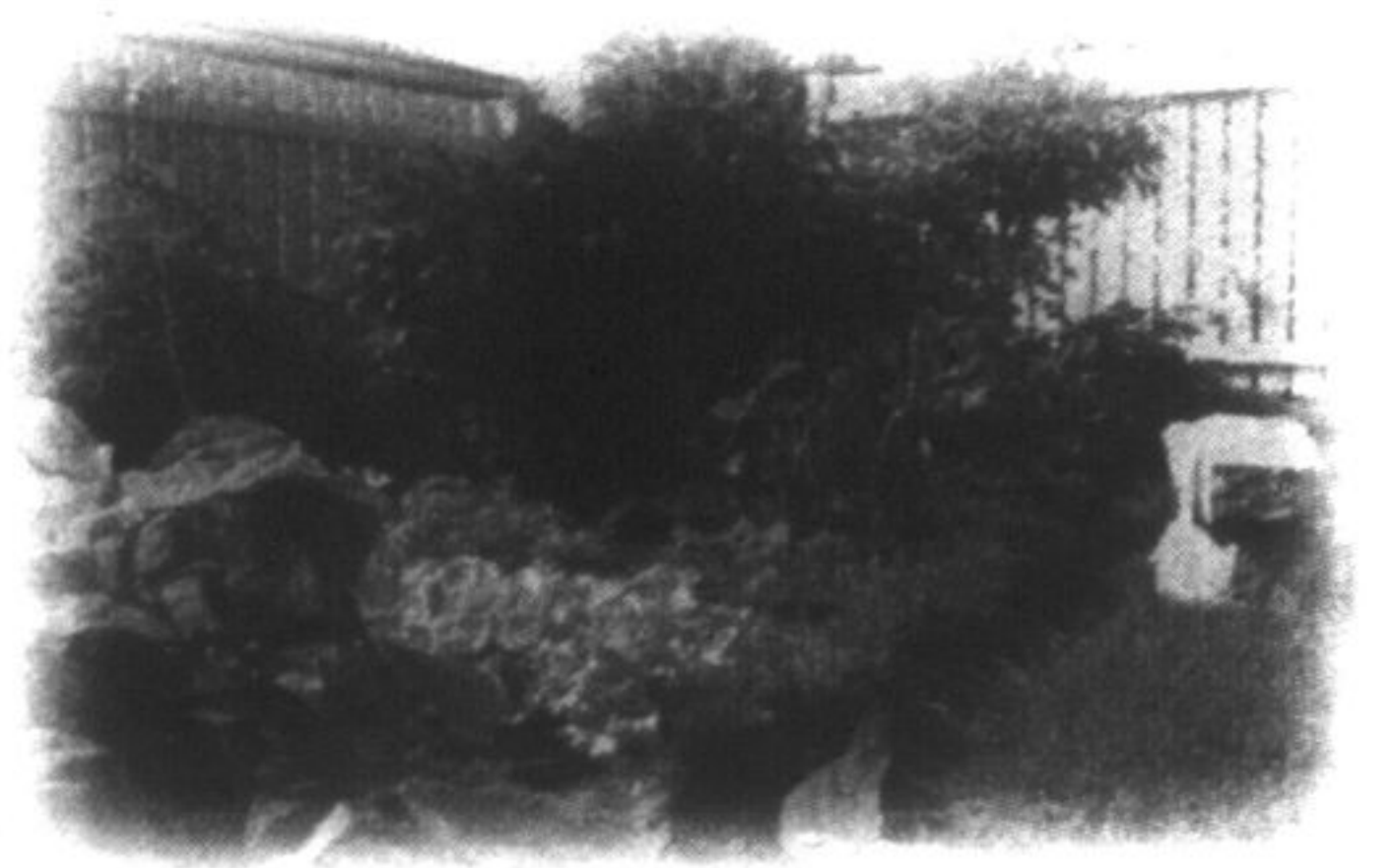
A vegetable garden doesn't need to be big to offer you a wide variety of vegetables and herbs.

verted into a vegetable garden, it is important to use enriched soil. Natural fertilizers, including the compost made from your own domestic waste, will do marvels. Insecticides or pesticides should not be used especially as you are sure to want to eat your home-grown vegetables. Be sure to water your garden well. Watering thoroughly two or three times a week is better than watering superficially on a daily basis