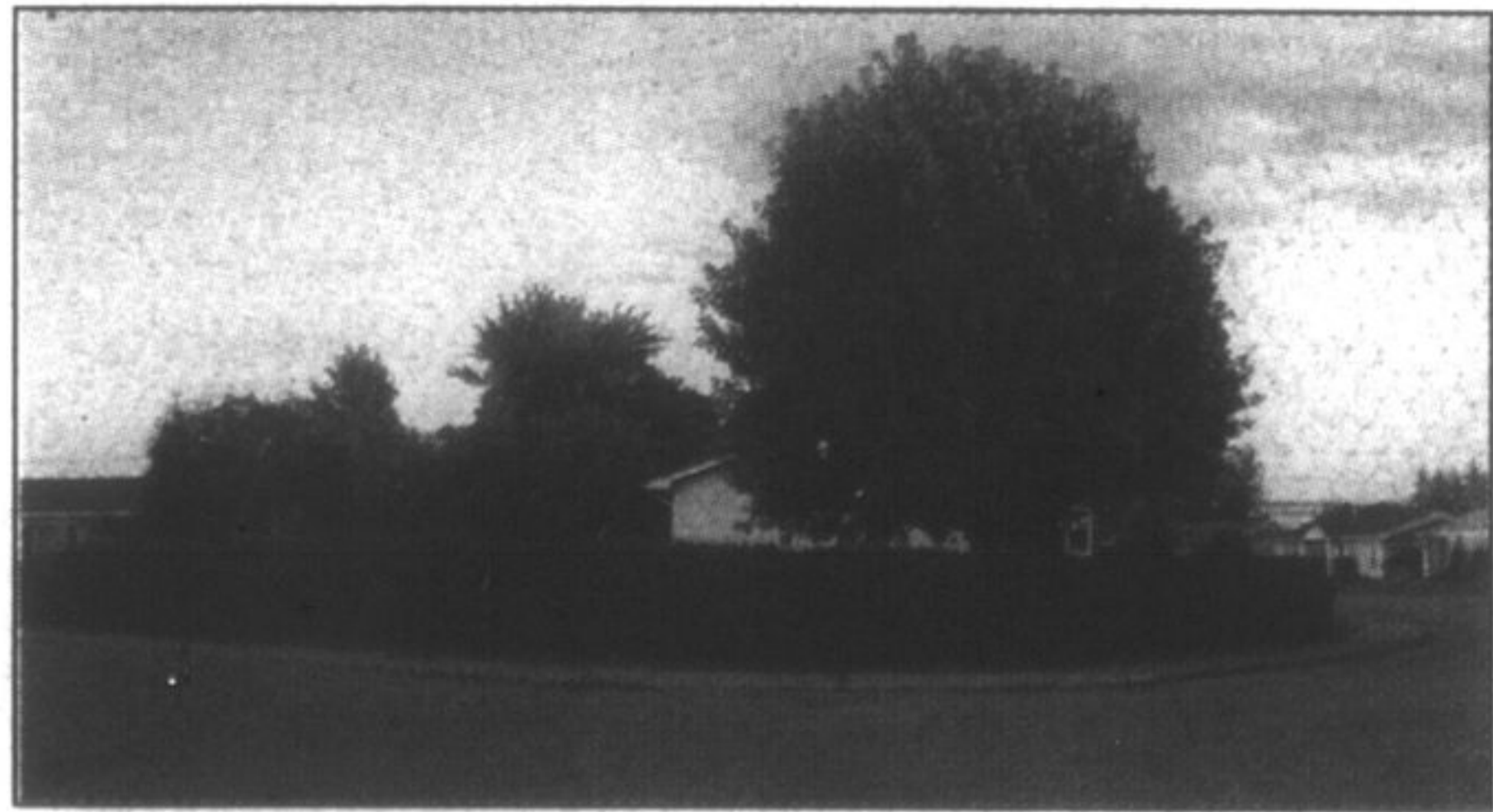
A privacy fence allows the installation of a pool or a gazebo protected from curious looks. A low wall completes the arrangement of this street corner.

ronment. Closing the frontage also allows for the worry-free installation of a pool or a gazebo. It's always possible to plan a small arrangement outside the enclosure to embellish the view.