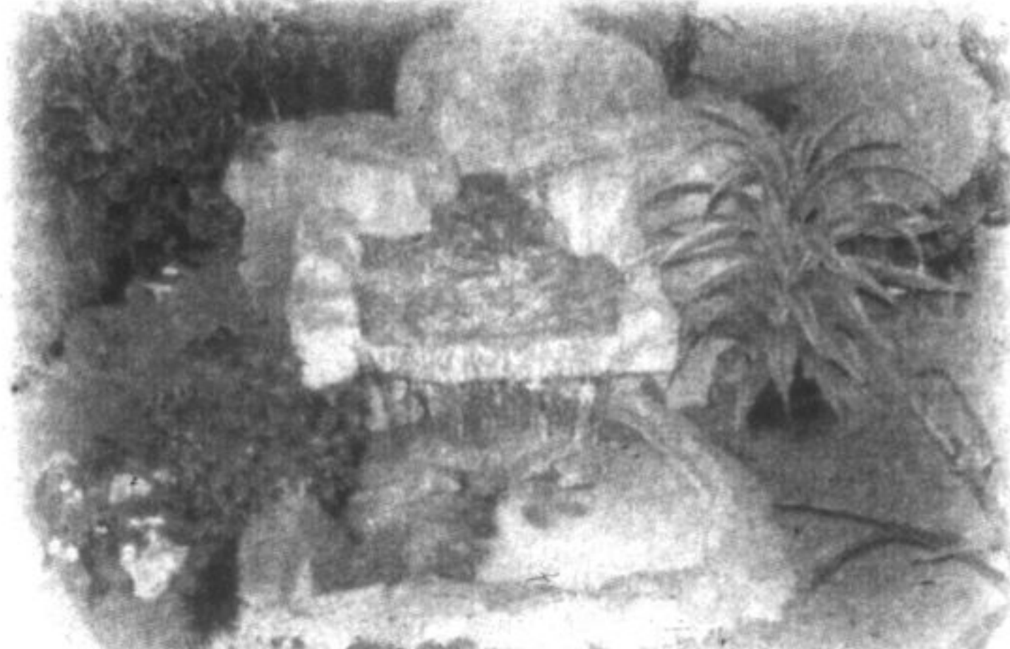
A pretty, cascading fountain that can be introduced alone or in a water garden.