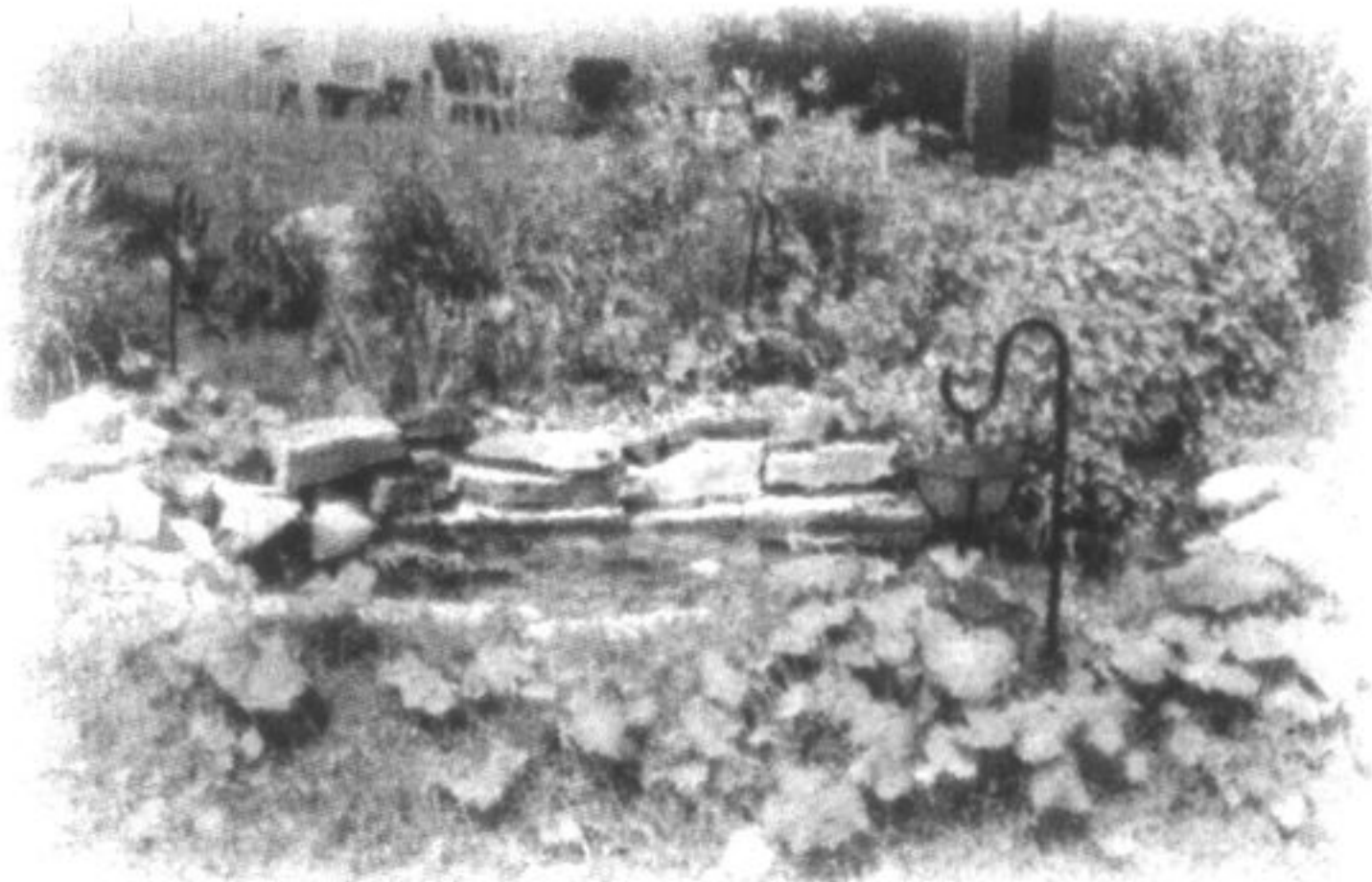
Superb water garden, beautifully integrated into the landscape.

The design requires a little less planning if you would rather opt for a fountain. You just need to choose the site, taking into account the fountain's dimensions and its harmonization with the existing garden. Some types of cascading fountains can become an integral part of a water garden.