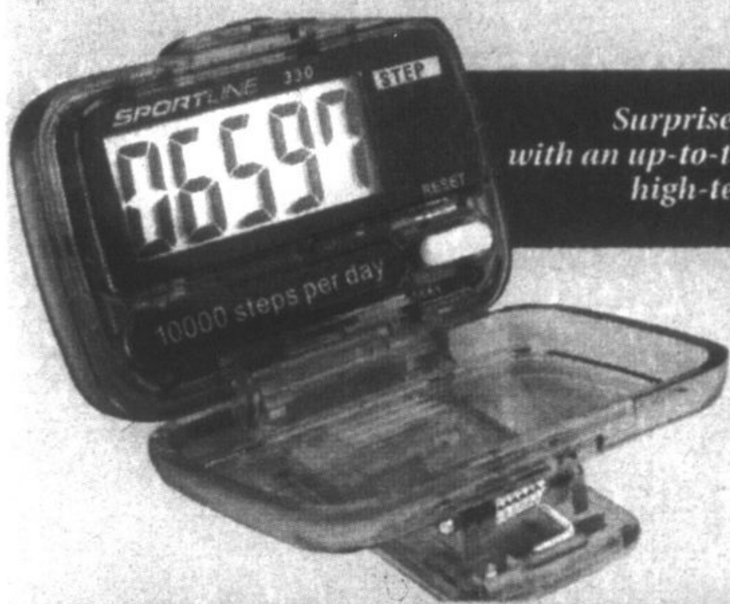
Surprise your mom with an up-to-the-minute, high-tech present.

Mom doesn't live in the same town or in the same area as you? Never mind. Offer her a webcam so that she can see and talk to you easily even though you're far apart. She could also use this device to talk with her beloved grandchildren. This year, on May 11th, surprise your mother with a high-tech present that will help her organize that hurricane of daily jobs as well as allowing her to profit from the pleasures of life.