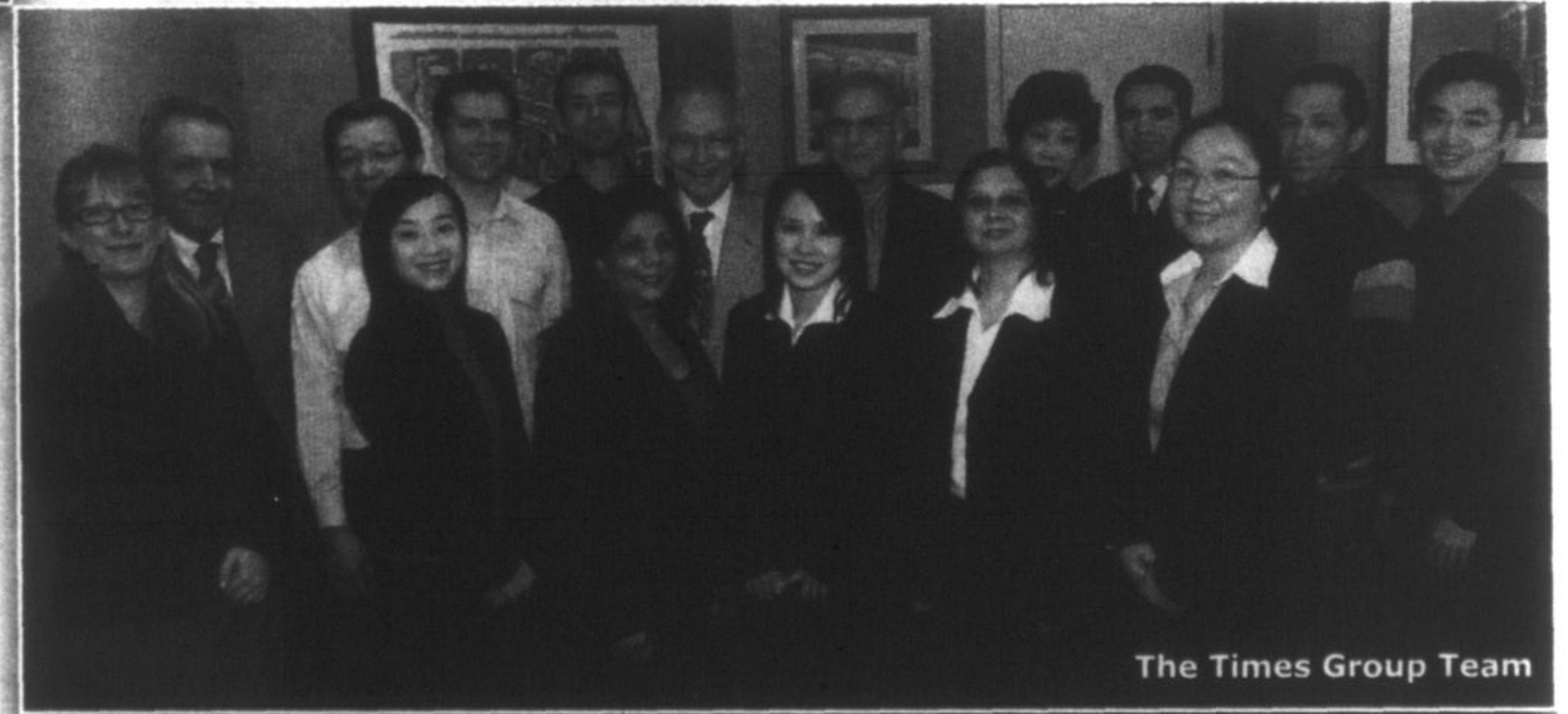
The Times Group Team