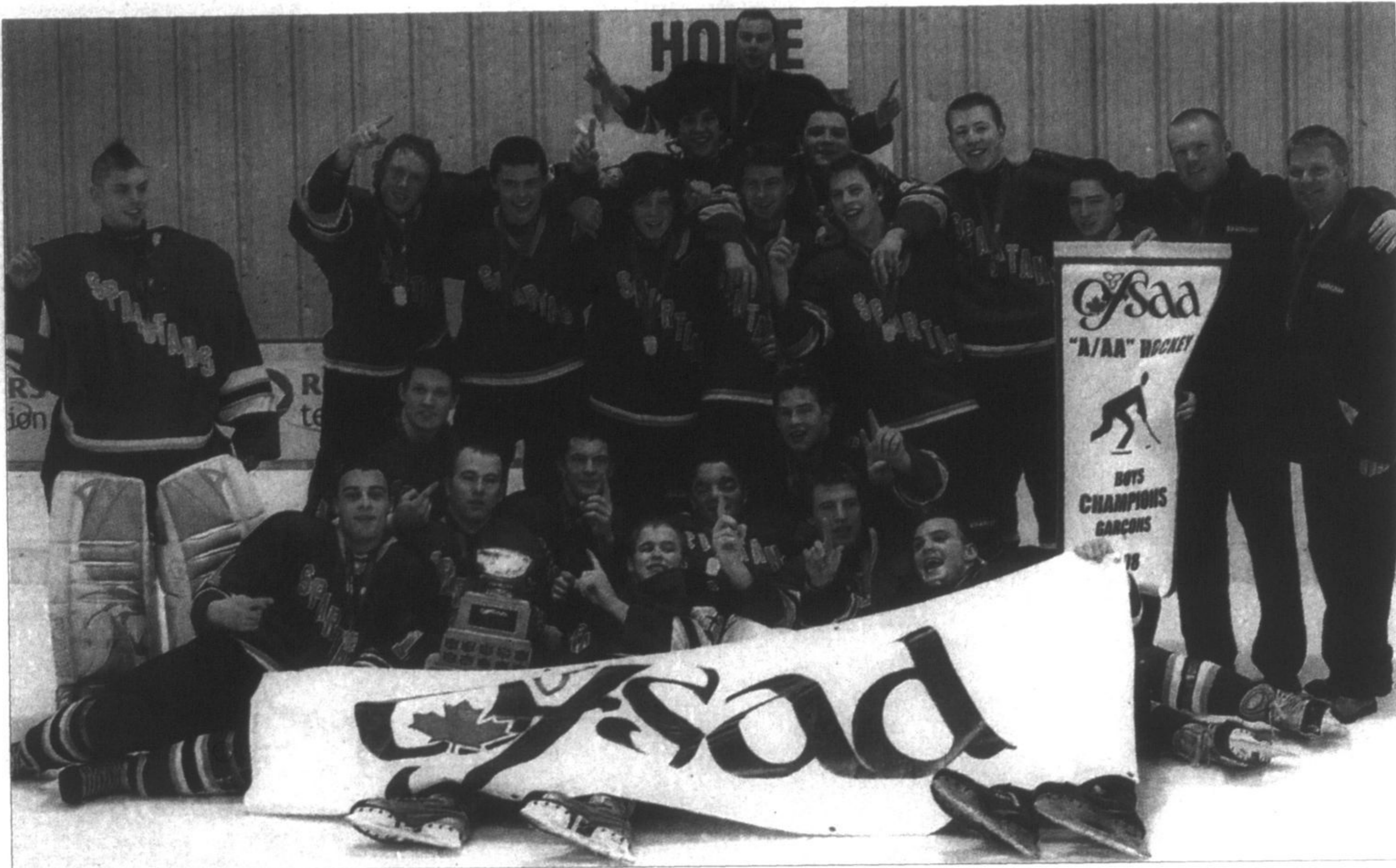
Stouffville District Secondary School's Spartan boys celebrate winning back-to-back Ontario high school A/AA titles in Ottawa Saturday.

The 2009 OFSAA tournament will be held in Orillia.