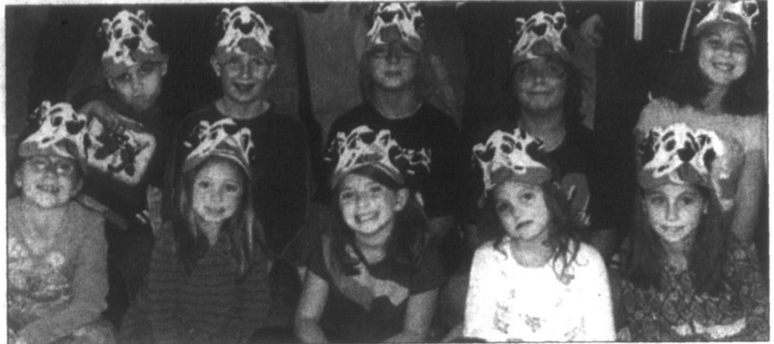
Some members of the large cast of YDAPA's 101 Dalmatians production.