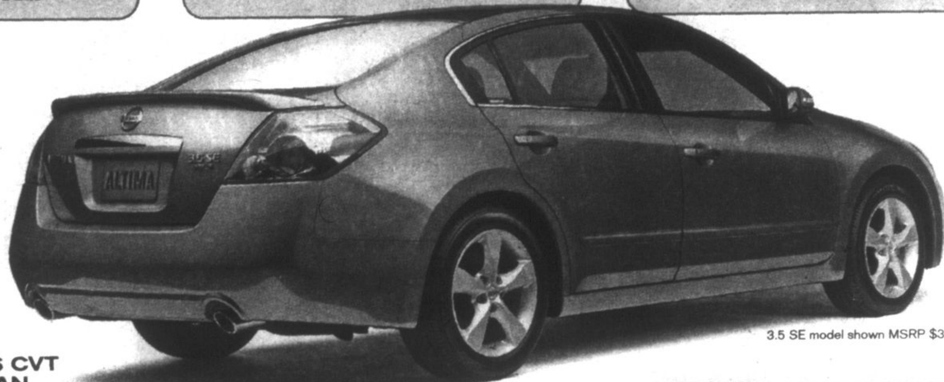
3.5 SE model shown MSRP $30,298 1

LEASE RATES AS LOW AS 1.5% FOR UP TO 60 MONTHS