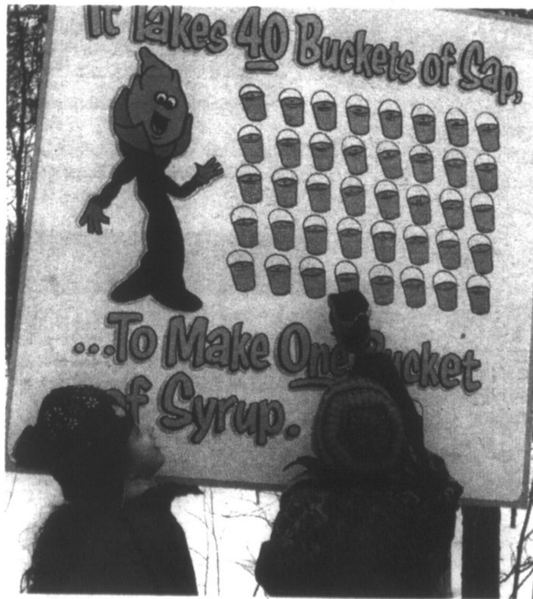
Young visitors count the number of buckets of sap it takes to make a bucket of syrup on this information board.