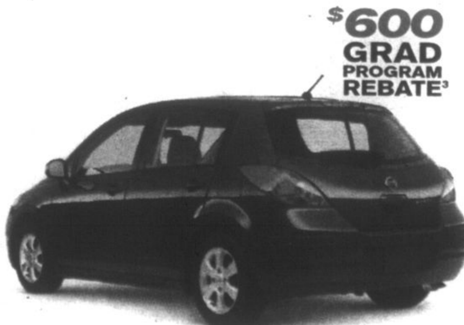
THE 2008 NISSAN VERSA 1.8 S HATCHBACK WELL EQUIPPED WITH THE VALUE OPTION PACKAGE

LEASE RATE 3.9% $0 SECURITY DEPOSIT $2,999 DOWN PAYMENT