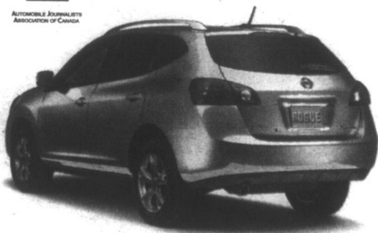
THE ALL-NEW 2008 NISSAN ROGUE 2.5 S FWD