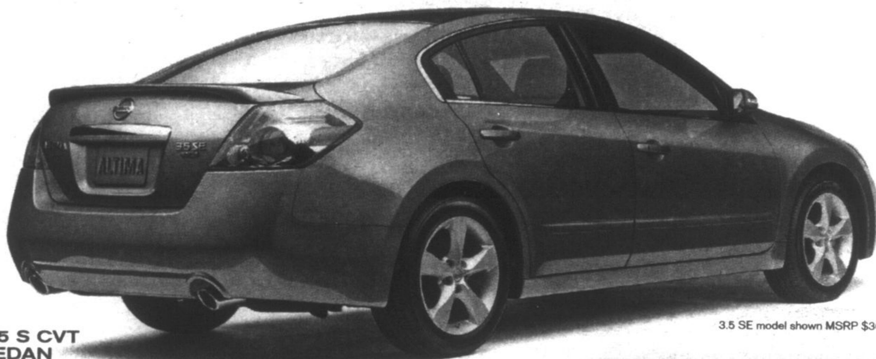
THE 2008 NISSAN ALTIMA 2.5 S CVT SEDAN

LEASE RATES AS LOW AS 1.5% FOR UP TO 60 MONTHS