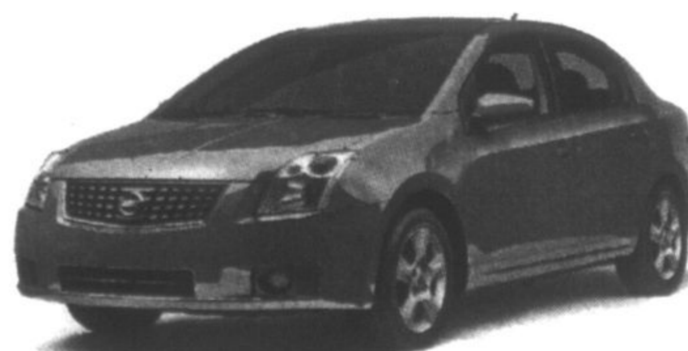
THE 2008 NISSAN SENTRA 2.0 WELL EQUIPPED WITH THE VALUE OPTION PACKAGE

LEASE RATE 1.5% $0 SECURITY DEPOSIT $0 DOWN PAYMENT