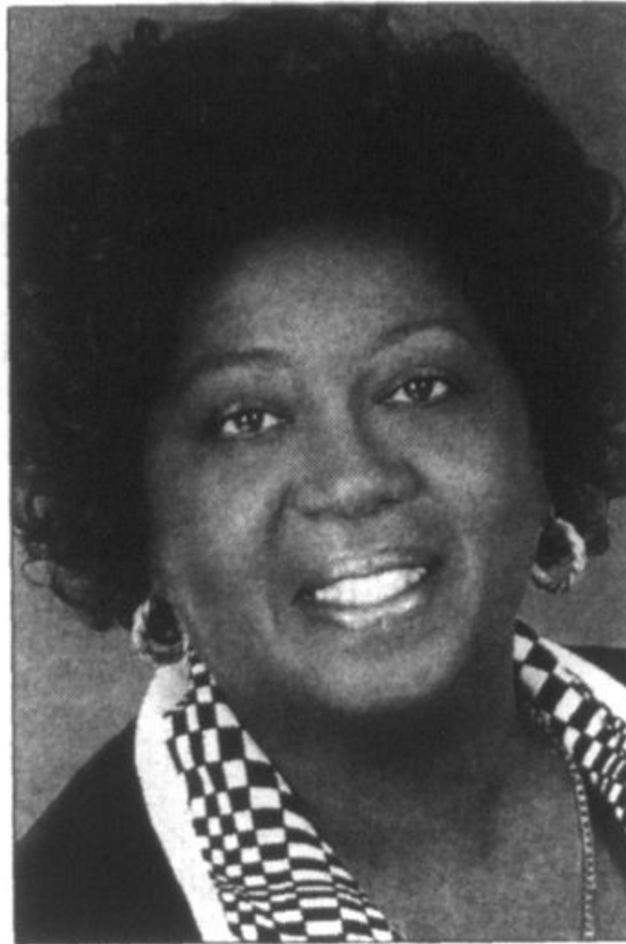
JEAN AUGUSTINE: Ontario's first fairness commissioner was also Canada's first black, female MP.

The luncheon is sponsored by the Whitchurch-Stouffville Women of Dis-