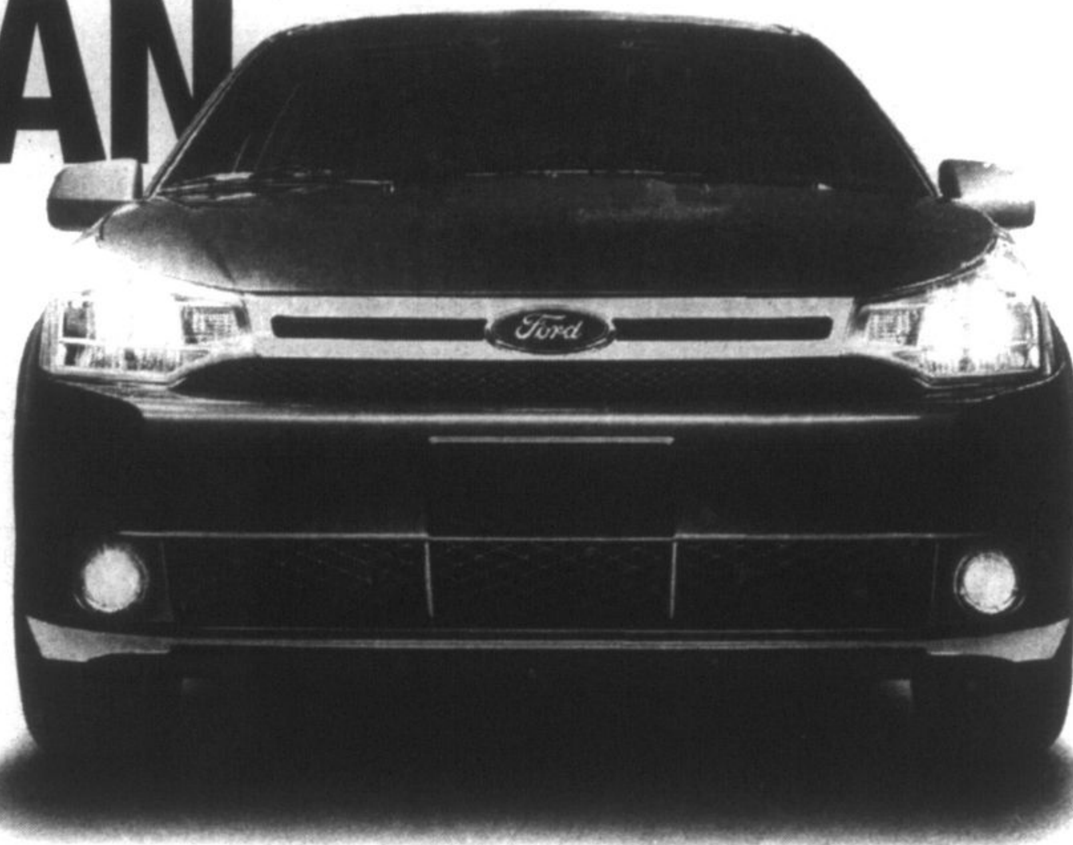
Focus SES shown with optional equipment. $19,149.

Includes EXCLUSIVE CANADIAN DELIVERY ALLOWANCE