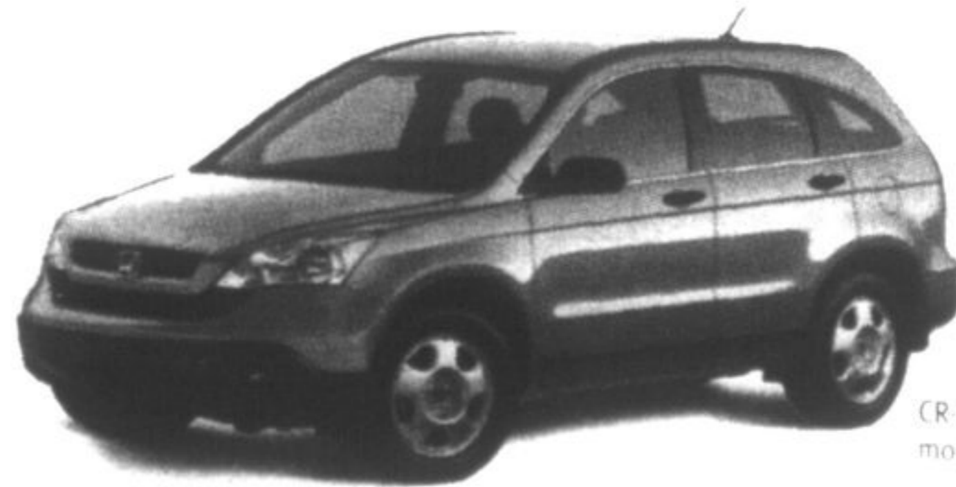
CR-V LX model RE 3838E

LEASE FOR $298 | LEASE APR 1.9% PER MONTH FOR 48 MONTHS ON APPROVED CREDIT WITH $2,666 DOWN.