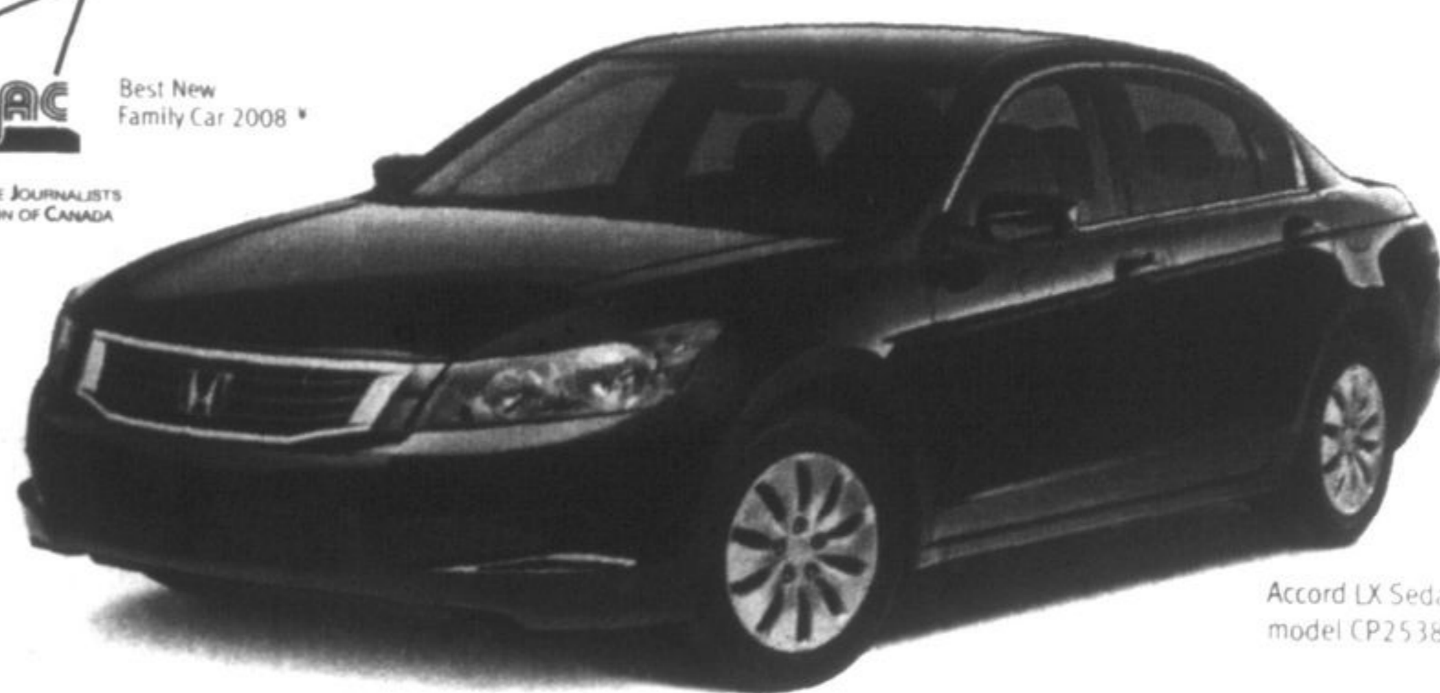
Accord LX Sedan model CP2538E

LEASE FOR $298 | LEASE APR 2.9% PER MONTH FOR 48 MONTHS ON APPROVED CREDIT WITH $1,561 DOWN.