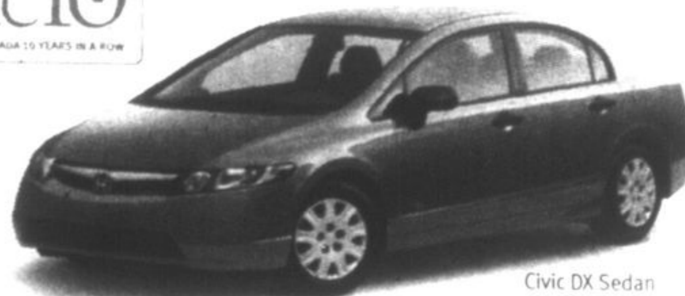
Civic DX Sedan model FA1528EX

LEASE DOWN PAYMENT $0 | LEASE FOR $198 | LEASE APR 1.5% PER MONTH FOR 60 MONTHS ON APPROVED CREDIT.