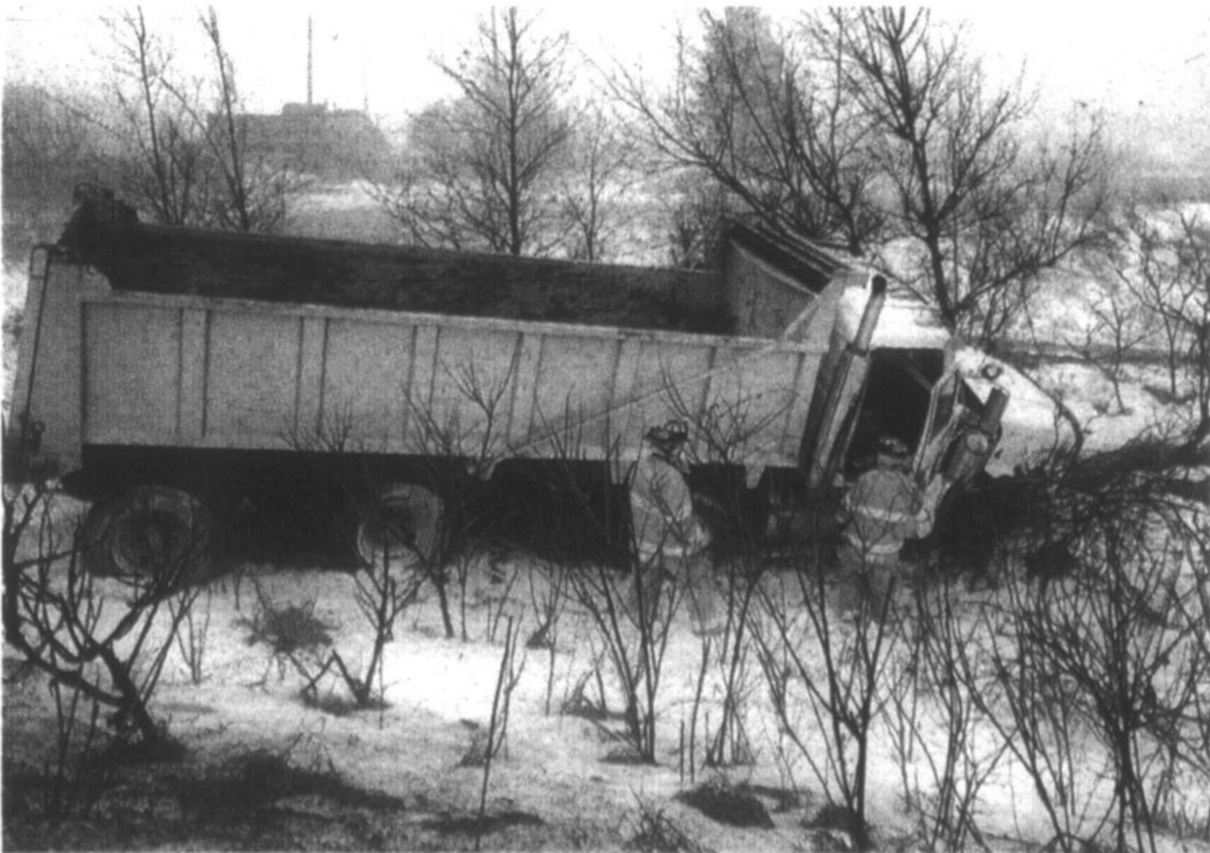
Whitchurch-Stouffville firefighters check out the dump truck in the ditch. The intersection was closed through the evening rush hour because a traffic light pole was damaged.