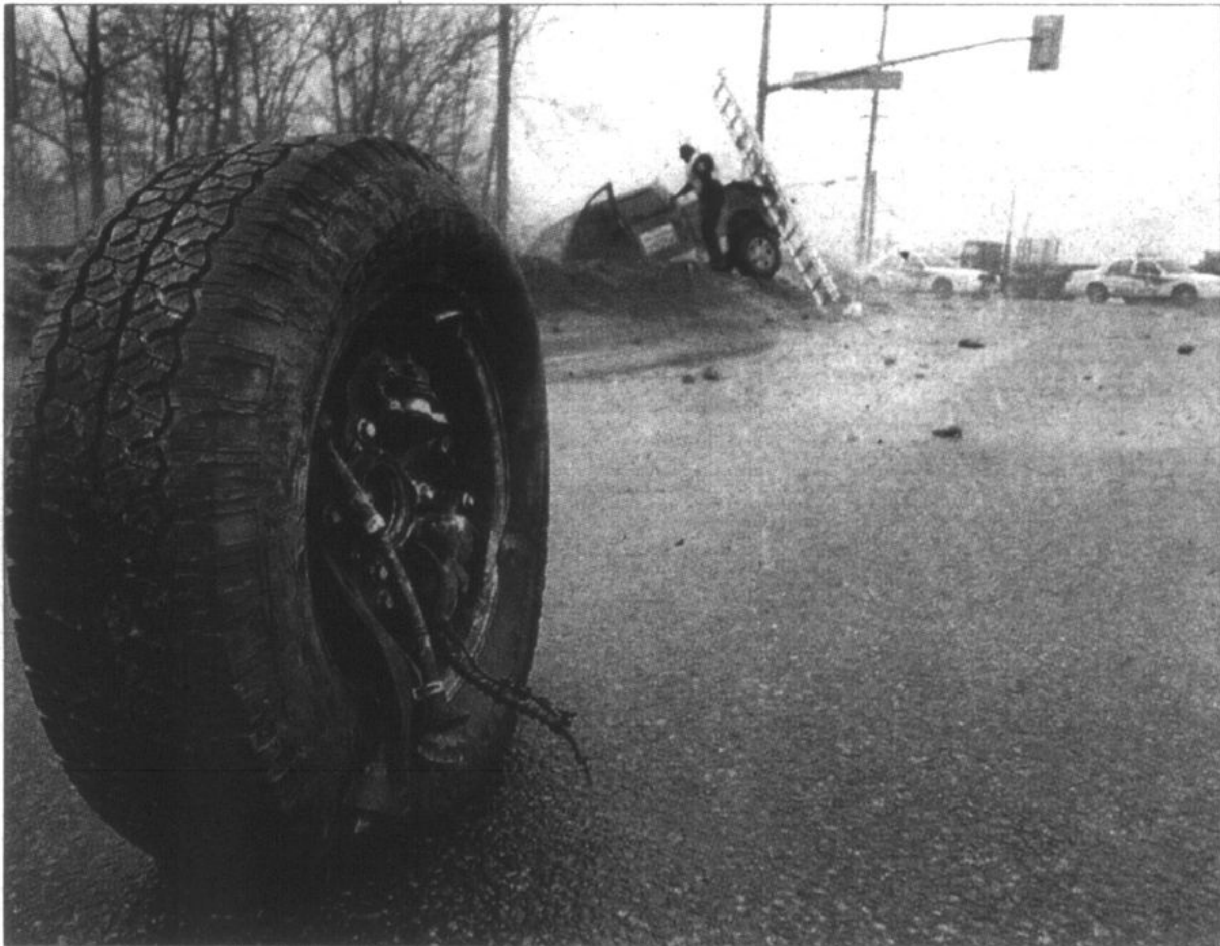
A tire from the pick-up (in background) is left standing on Bloomington Road.

A pick-up truck straddles a guard rail at Bloomington Road and Woodbine Avenue after a collision with a dump truck in heavy fog Monday afternoon. The dump truck went over south Bloomington guard rails. Both drivers escaped serious injury.