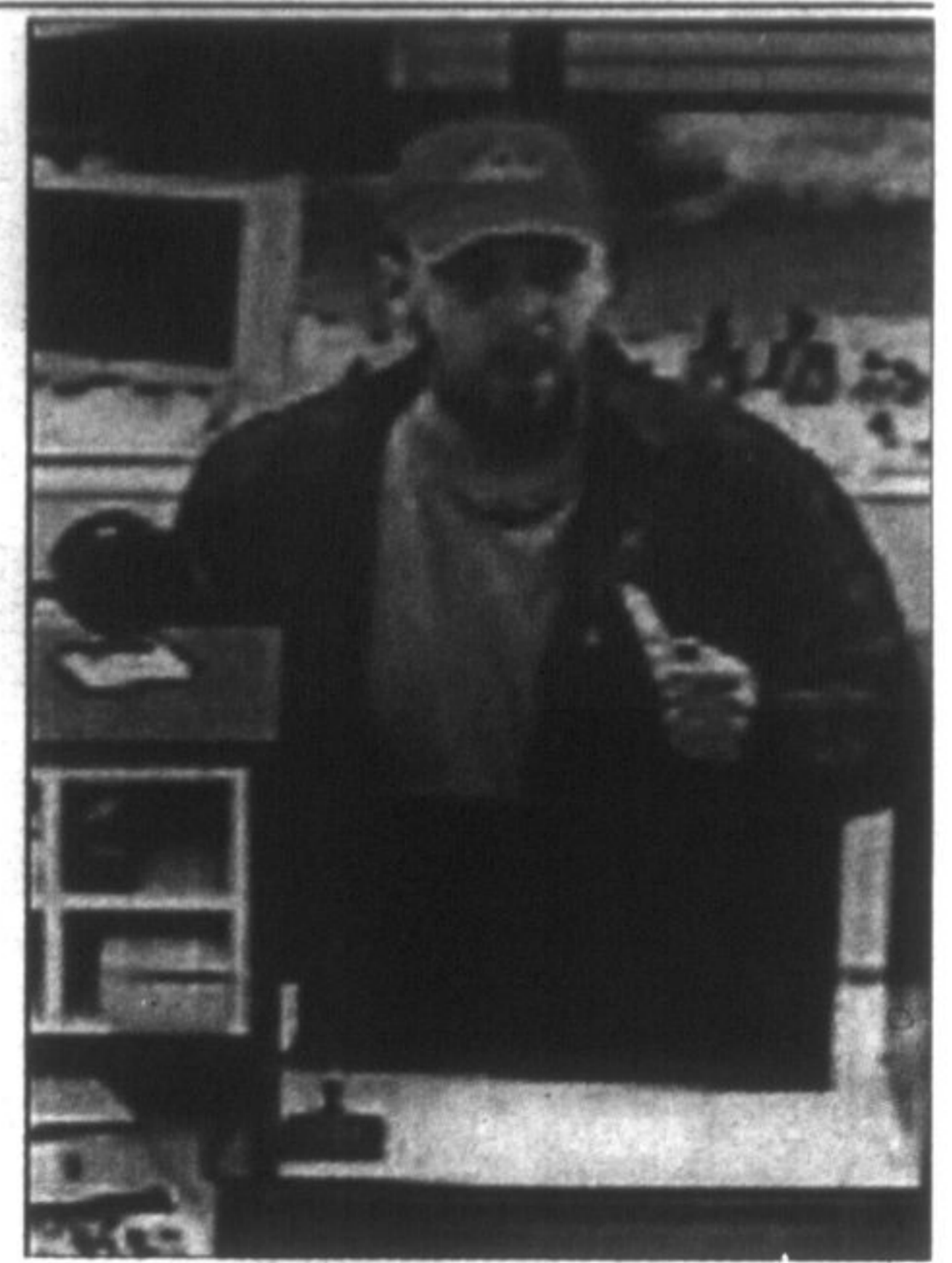
A man is captured on video attempting to rob Pace Savings and Credit Union in Stouffville Tuesday.