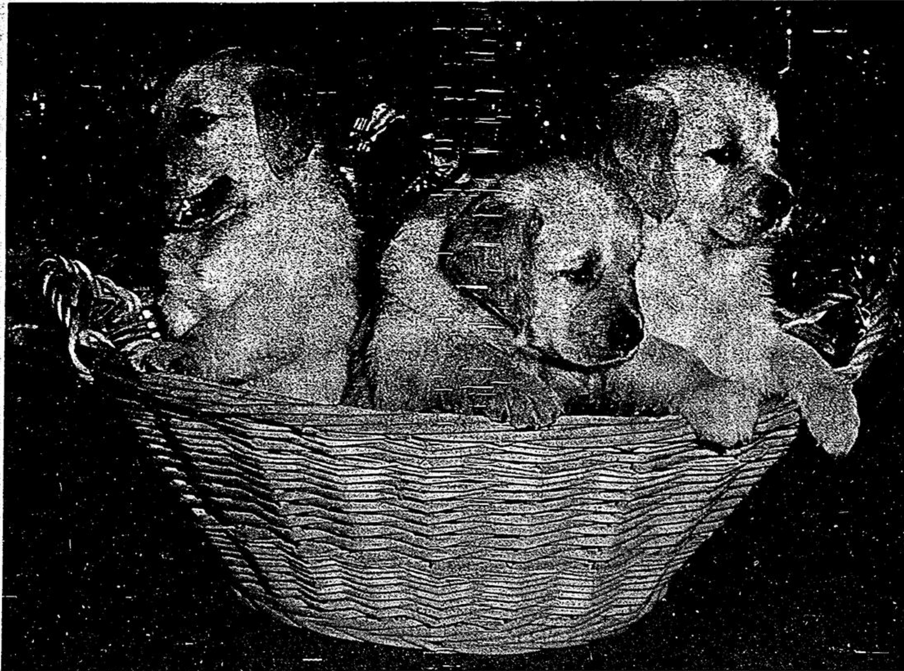
A gift at Christmas that lasts all year long