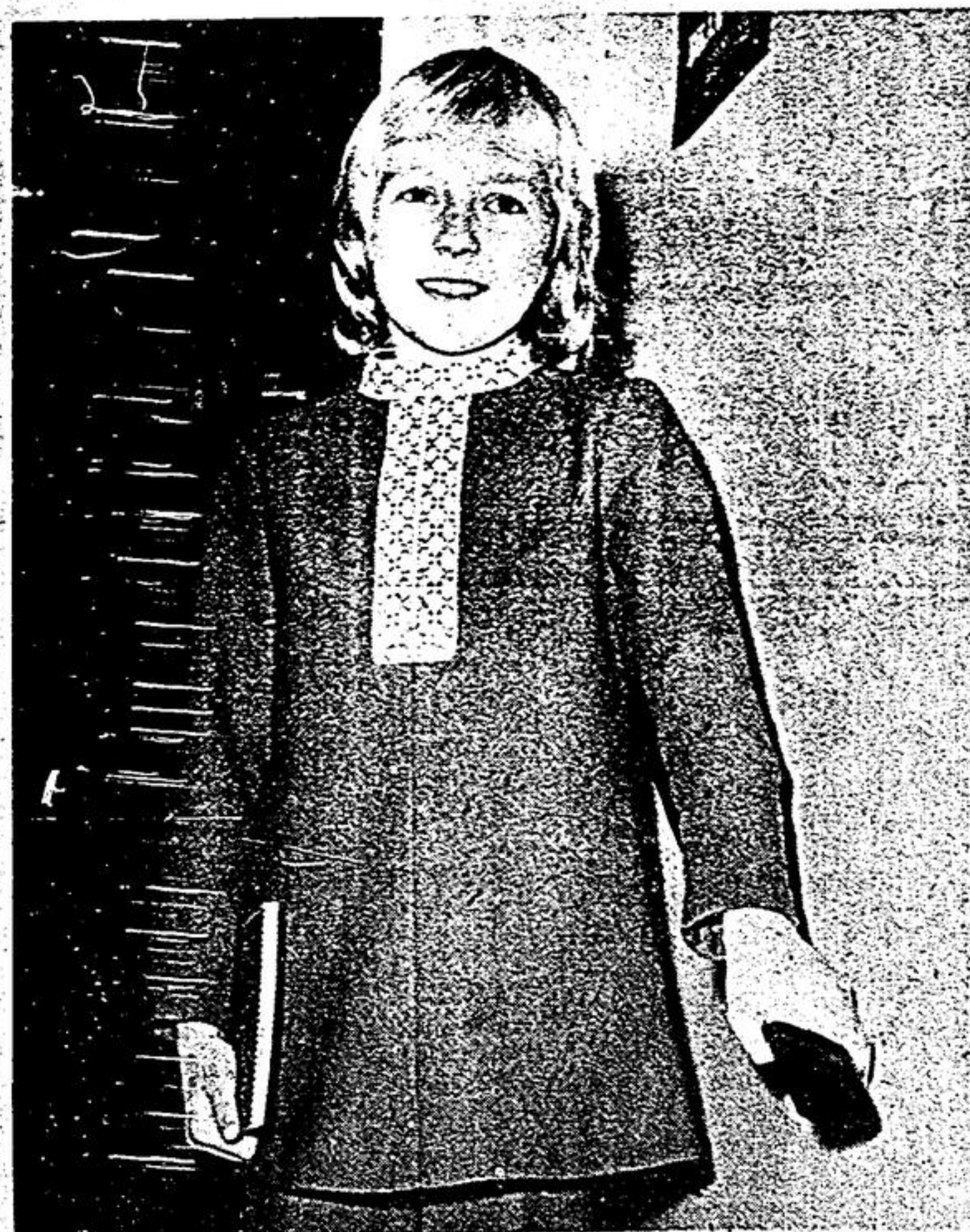
'At home' for hearing

The Library will be closed, over the Christmas season on Dec. 23, 26 and 30.