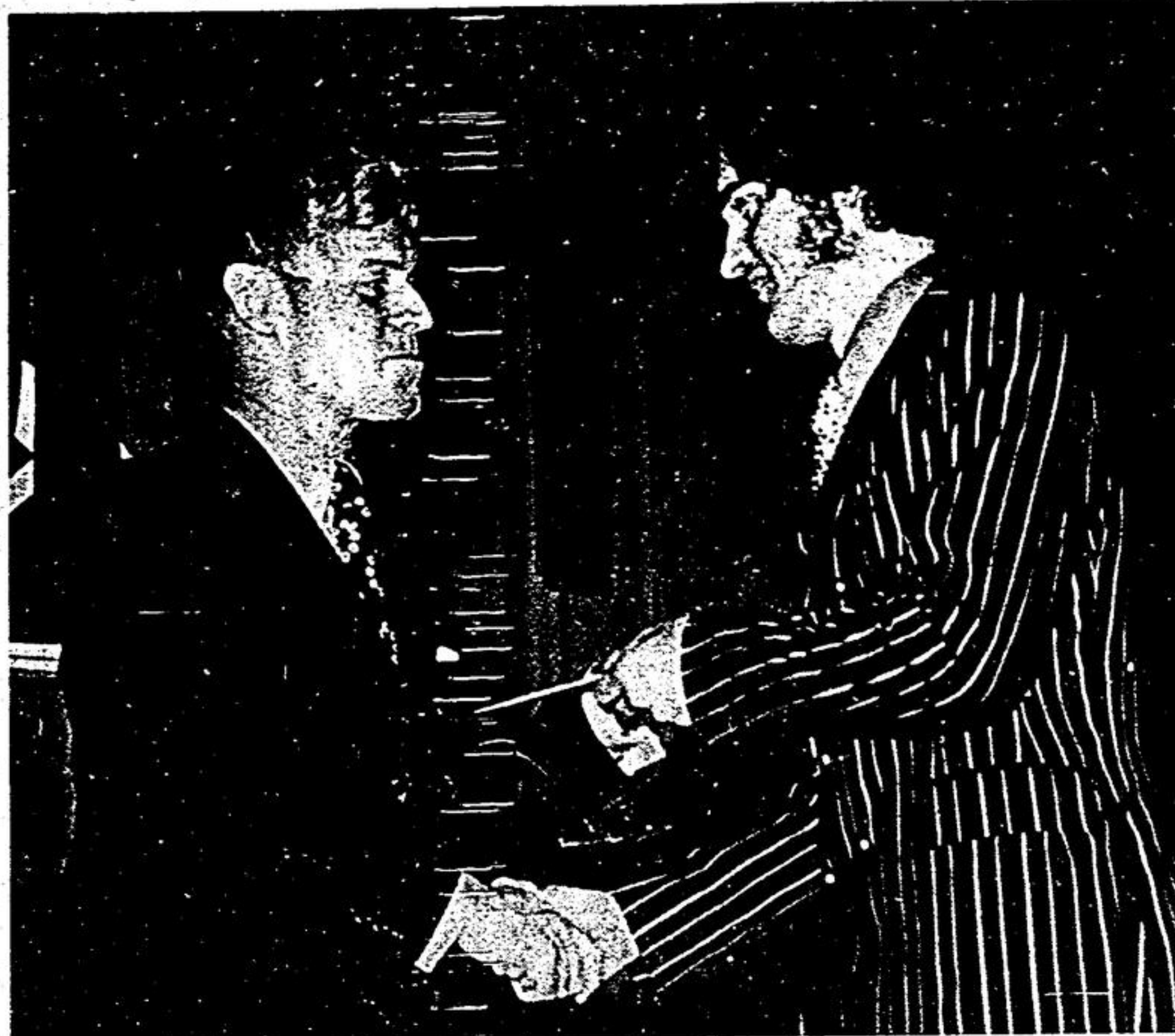
School valedictorian honored