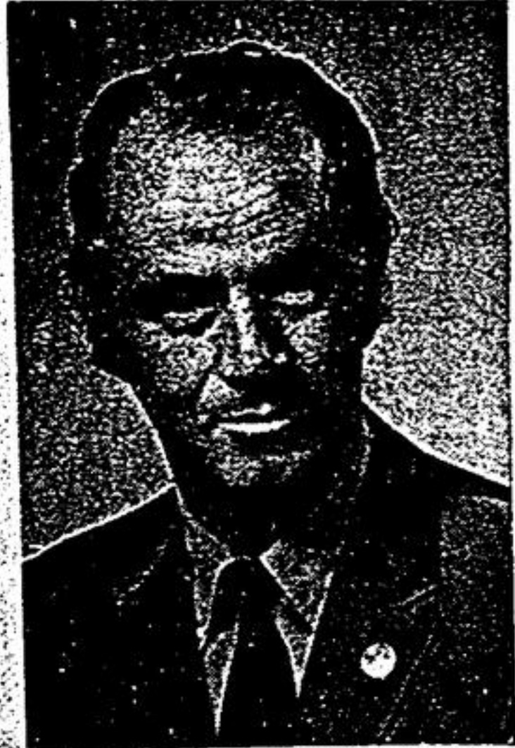
FOR "PEOPLE SERVICES"

'Look Back In Anger'. But, no drama group worth its grease paint should be censored by public tastes. It must plumb its own depths. This time, The Players' floundered a little. Let's establish it was worth the experiment. With 'Look Back' the club took a step forward.