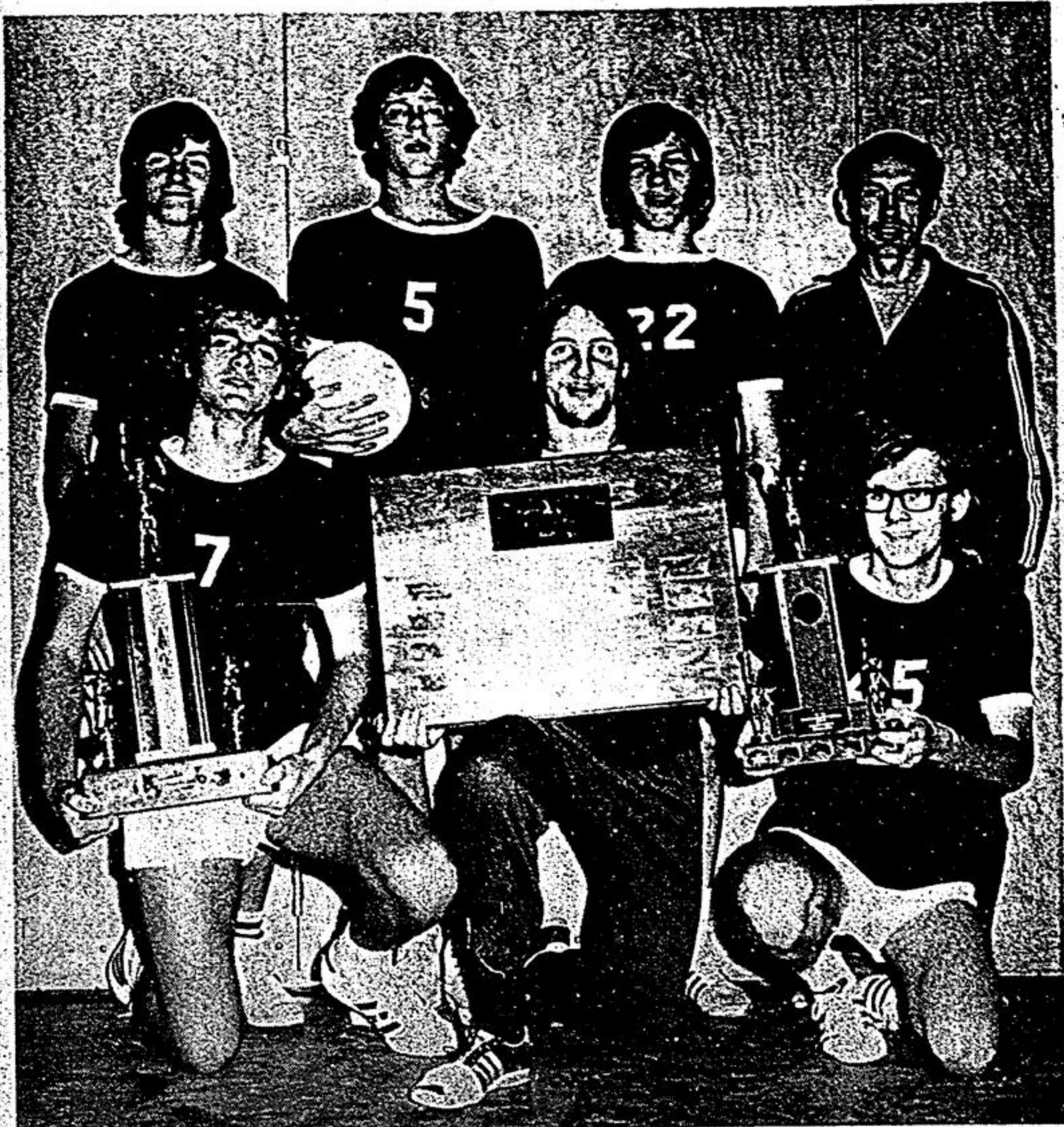
Bid for Ontario Volleyball title