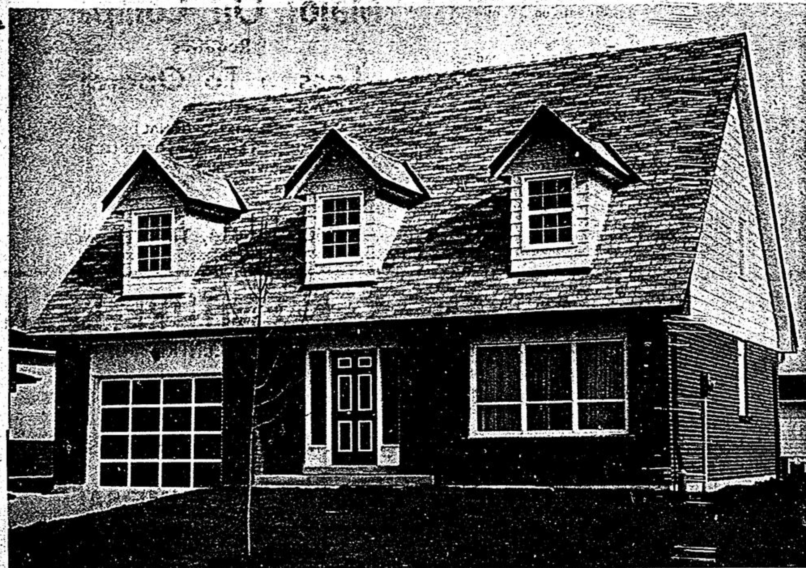
Unionville is growing, and with the completion of this most recent phase, will extend through to the 5th concession. A typical home in the new 'Village in the Valley' area is this chateau-type, 4-bedroom residence. A large shopping mall is also planned, to eventually serve a population approaching 5,000. —Jim Thomas.