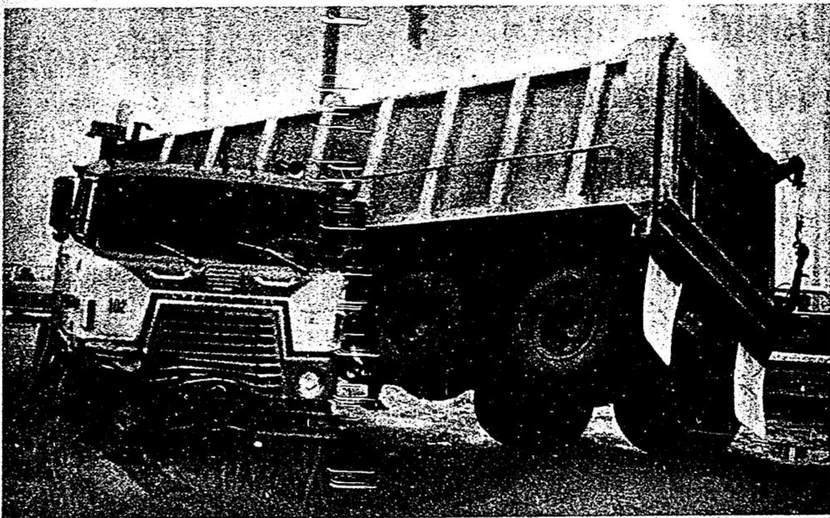
Truck jack-knives following fatal crash on Bloomington Road.

The Ontario Hydro has warned that power breaks will be more frequent than usual this winter due to the recent strike. According to them, the usual maintenance was not done during the summer so that lines will be going down when the rough weather comes. Be warned! Be prepared! Due to a severe attack of bronchitis, two children sick with the flu and husband