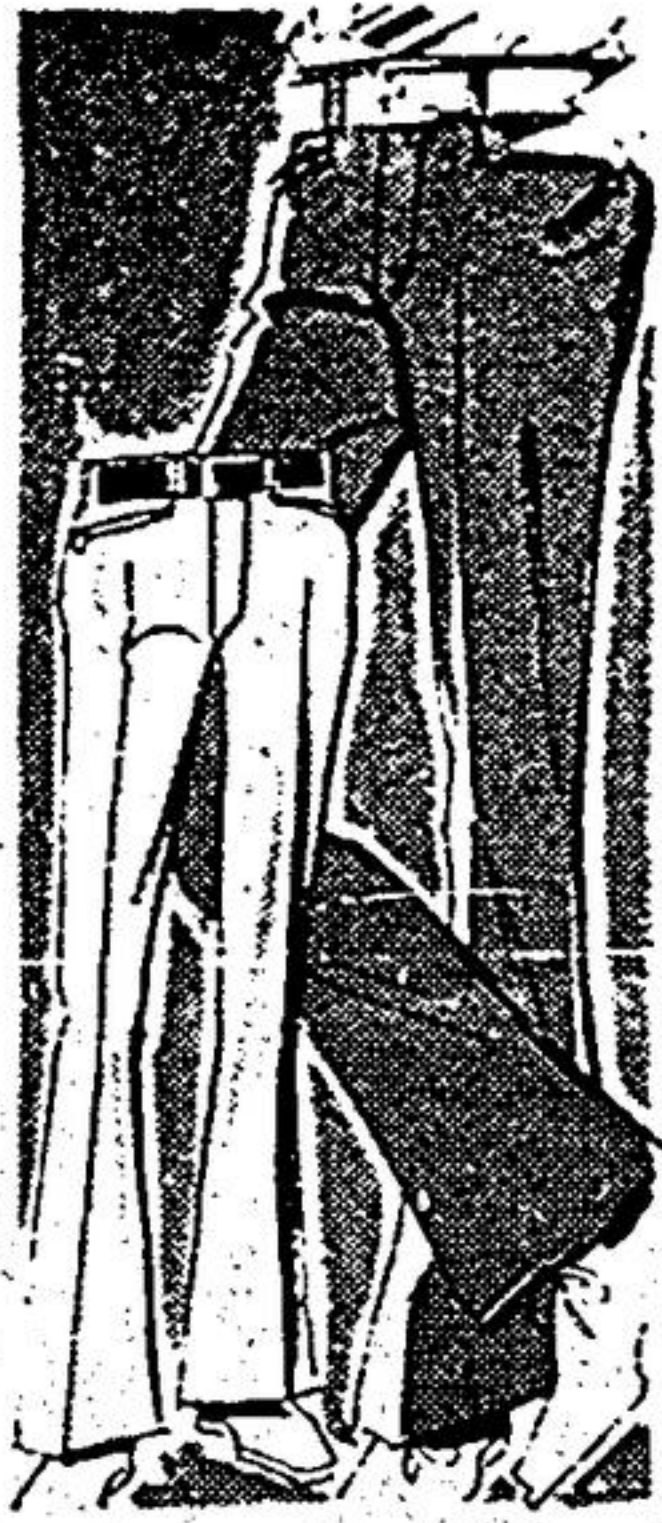
Men's Slacks in 100% Wool Flannel and Double Knits

You'll recognize the famous label. The fabric is English Crimplene, the styling classic. Size 36 to 46 in navy, brown, and plum.