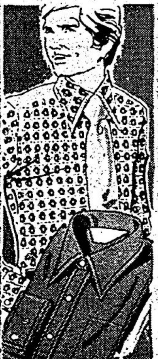
Men's Knit Shirts by one of Canada's Top Shirt Makers

In 65% Polyester, 35% Cotton perma press. Checks, stripes, overall patterns, abstracts, and plain shades. In sizes S. M. L. XL.