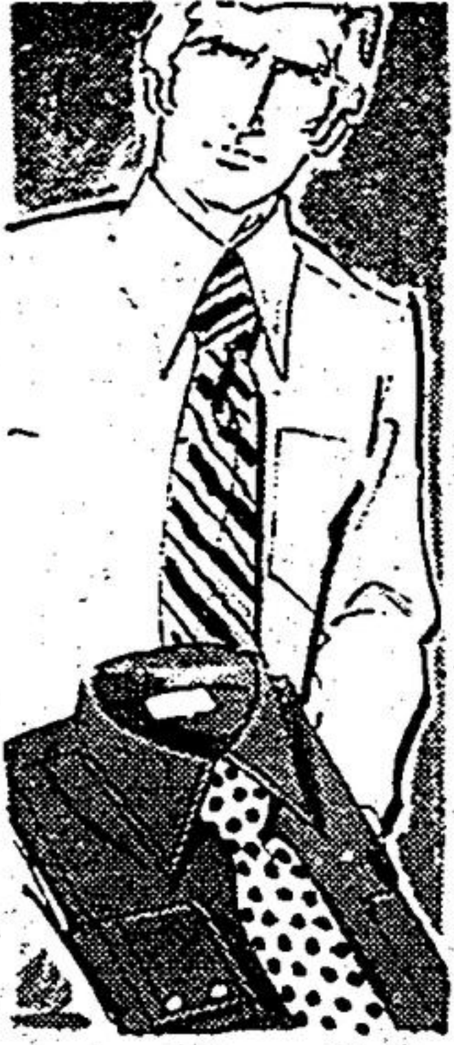
Men's Long Sleeve Dress Shirts in 65% Polyester, 35% Cotton

100% pure virgin wool flannel slacks are in plain shades of brown, grey, navy, olive, camel, size 30 to 44. 100% double knit slacks are in fine herring bone in plain shades of navy, brown, grey, wine, moss, size 30 to 44.