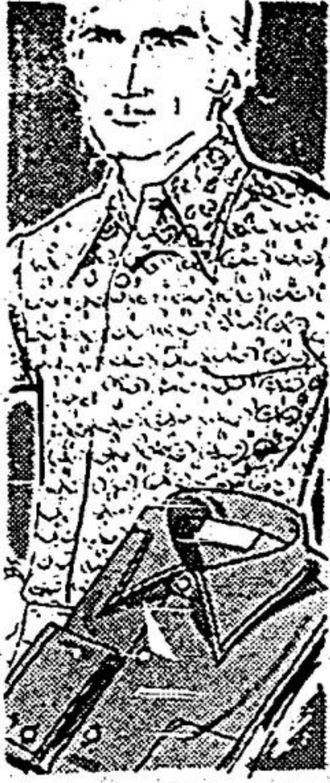
Men's Long Sleeved Sport Shirts Tailored by Van Huesen

Our own "Sutton" brand shirt, finely tailored with perma press finish, semi long pointed collar and 2 button cuff. Navy, wine, mid blue, black coffee, ginger, gold. Size 14 to 17 1/2. Sleeve lengths 32 to 35.