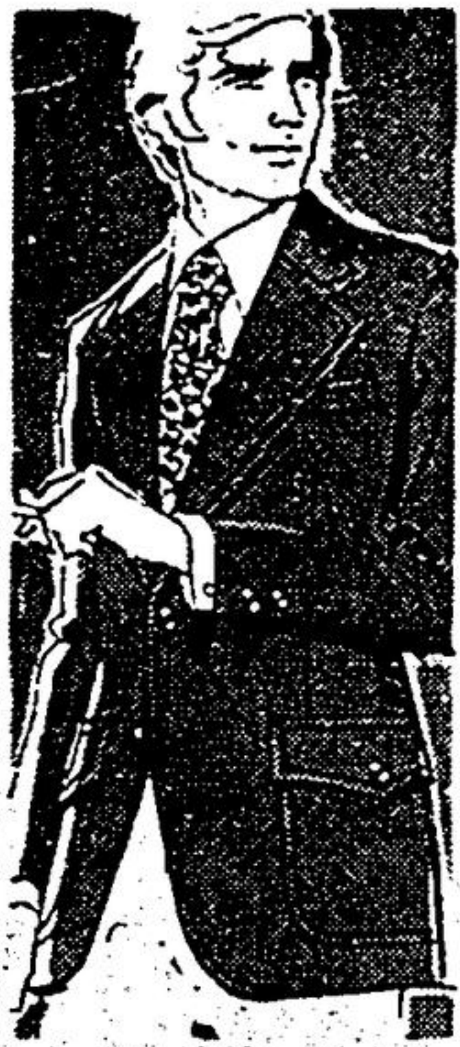
Men's Fine Quality Knit Sport Coat from Leading Manufacturer

To celebrate this grand opening we're offering you exciting savings. On items carefully selected to bring you the most for your money. At extra-low Celebration Sale prices! Don't miss out on the fun and savings! At Jack Frasers — tomorrow through Saturday.