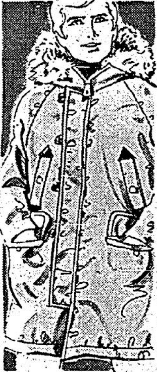
Boy's Snorkle Coat with Fur Trimmed Hooded Parka

In 50% Fortrel, 50% Cotton perma press with rounded collar and dressy placket front. Checks, tapestries, geometrics, in navy, brown and wine. Size 8 to 18.