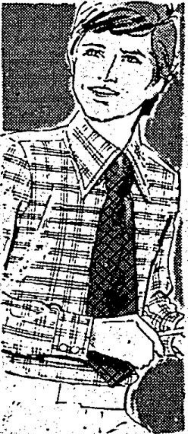
Boy's Long Sleeve Knit Sport Shirt by "Knickerbocker"

Best seller at reg. prices. Has great fit and look with patch pockets, zipper fly, blended contrast stitching, and flared leg. Huge color choice. Size 8 to 18.