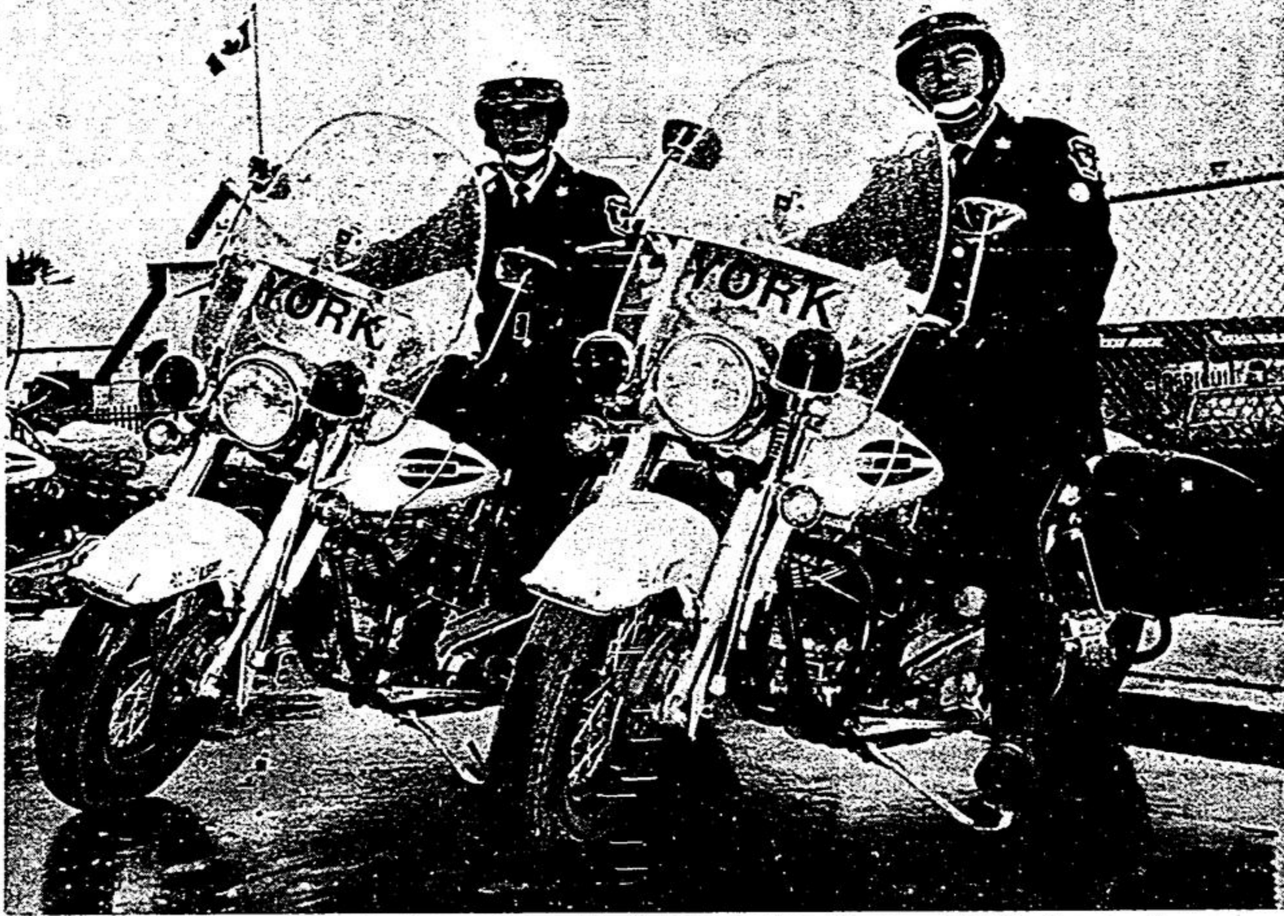
Motorcycle detachment with York Regional Police